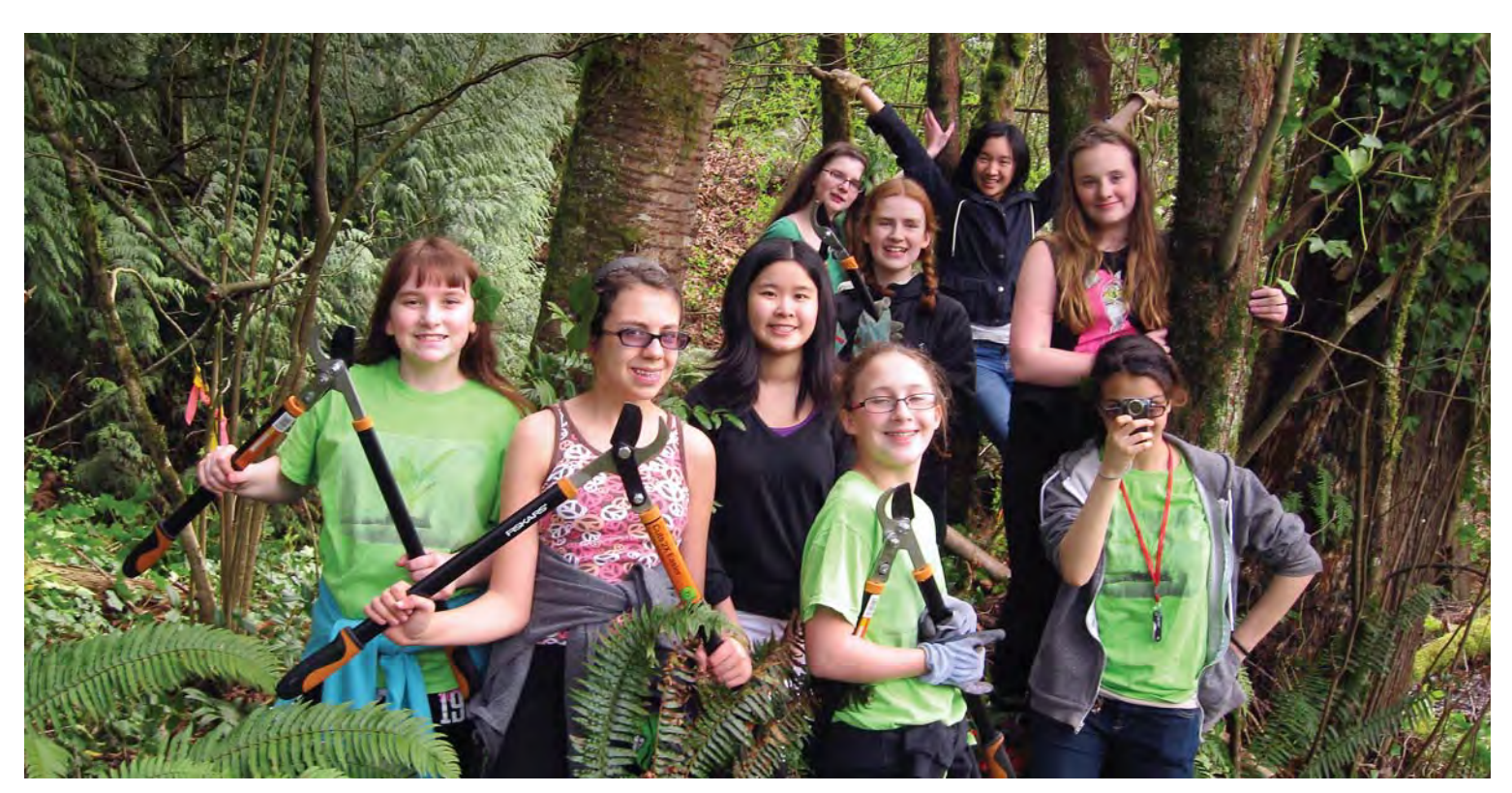
Issaquah Middle School Green Team.

Through the efforts of every fifth-grader at Westwood Elementary, the school increased its recycling rate from 43 to 54 percent and was recognized as a Level One King County Green School. The school expanded its lunchroom recycling program to include collection of food scraps for composting. Students use durable lunch trays and utensils and practice energy-saving behaviors.