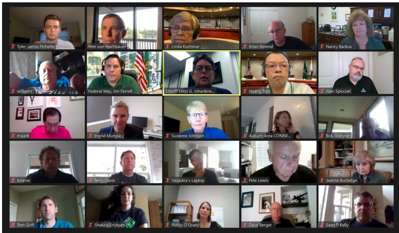
With South King County community leaders.