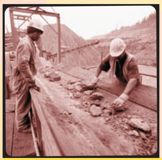
Employees of Renton Concrete Recyclers sort rubble that will eventually be placed under roads, sidewalks and driveways.

per yard for rubble measuring two feet or less, and $7.50 per yard for rubble two to four feet in size.