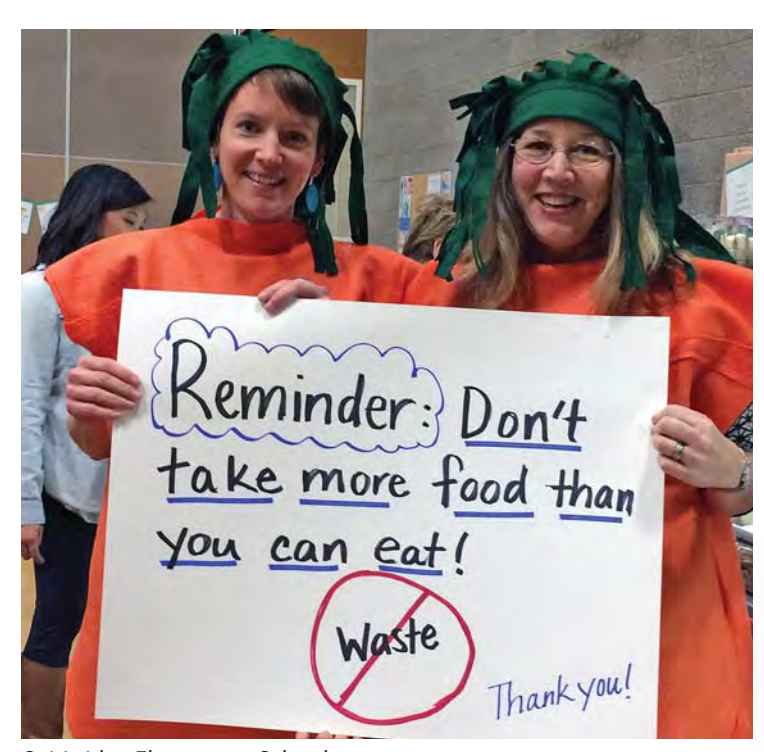
Spiritridge Elementary School

These two active Green Team members have contributed to the weekly Green Tips of the Week, helped write the school slogan Think Clean, Think Green, wrote a school chant and shared it at the monthly assembly, launched a water conservation poster contest, and helped produce a "We Create Change" fundraiser for the protection of wildlife and ecosystems. Every day, these two individuals consistently go above and beyond to make sure the school Green Team is making an impact.