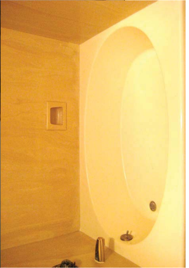
Clogged sink, tub or toilet