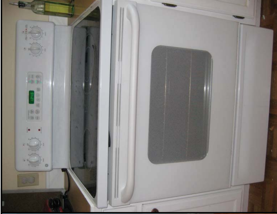
Bathtub, shower, sink, toilet Oven