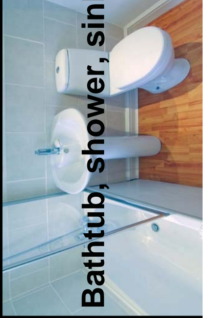
Bathhtub, shower, sink, toilet