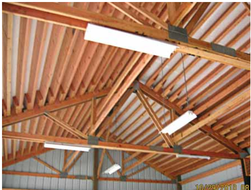
FSC-certified wood beams used in Skykomish Storage Building.