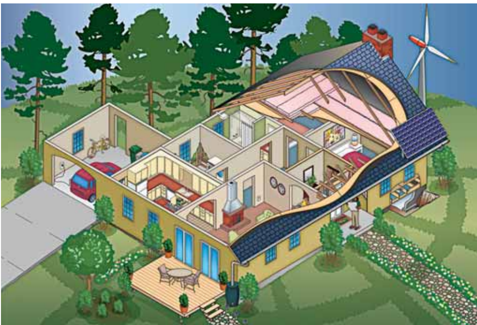
Interactive webpage of EcoCool Remodel Tool provides green building suggestions.

Governments for Sustainability, Built Green, and other green building experts) were invited to blog about the tool and new video series. This resulted in participation from 39 bloggers, resulting in numerous posts, newsletter stories, tweets and radio interviews. The web pages for the tool and video received a 98% increase in traffic for six weeks and 55 percent through December 2010. Additional support came from DNRP Public Affairs and internal social media experts.