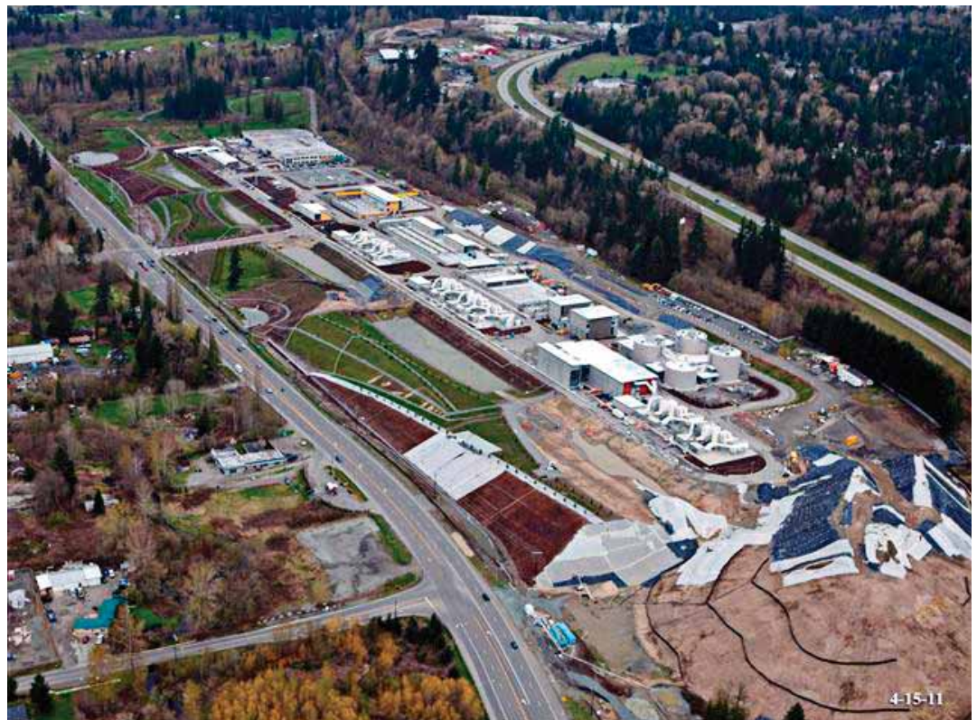
Aerial view of Brightwater Treatment System campus during construction.