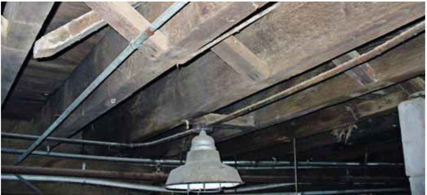
Wood beams that will be salvaged in deconstruction project.

Project-specific salvage and deconstruction assistance, including on-site building assessments, was provided at 18 different King County projects, including the South Park Bridge