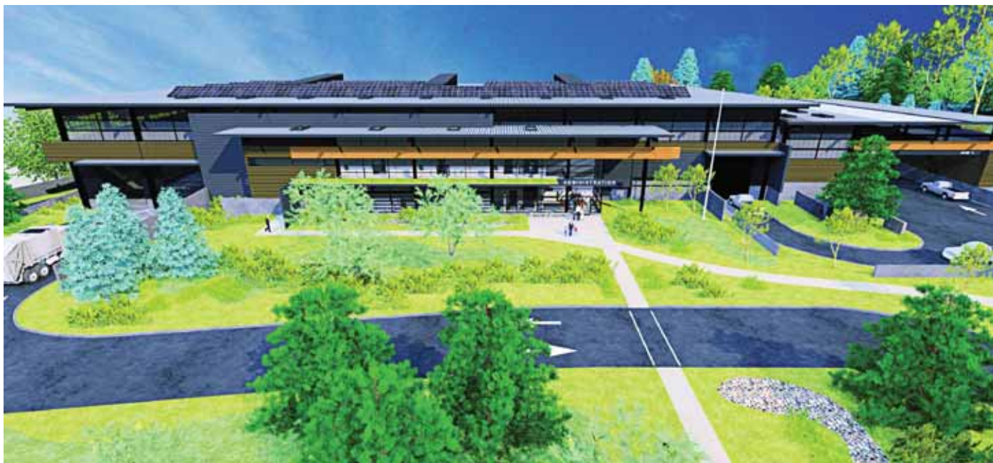
Architectural rendering of Factoria Recycling and Transfer Station, with the goal of achieving LEED Gold.