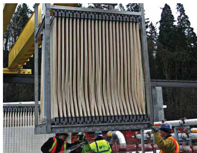
Installation of membrane bio-reactor filters (MBRs) at Brightwater Wastewater Treatment Plant.