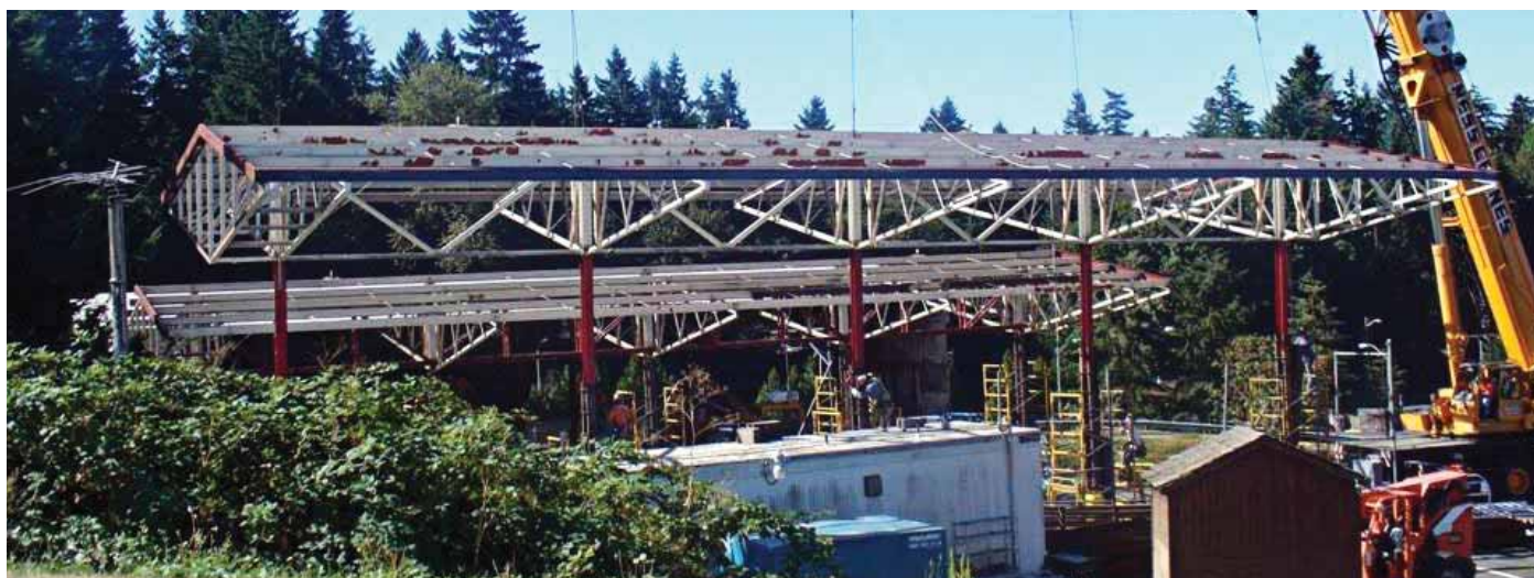
Houghton Transfer Station roof structures raised during construction for reuse.