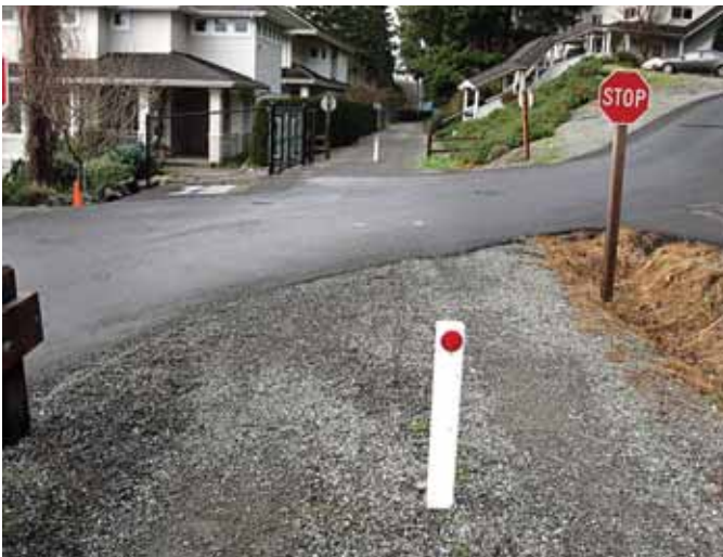
East Lake Sammamish Trail intersection before.