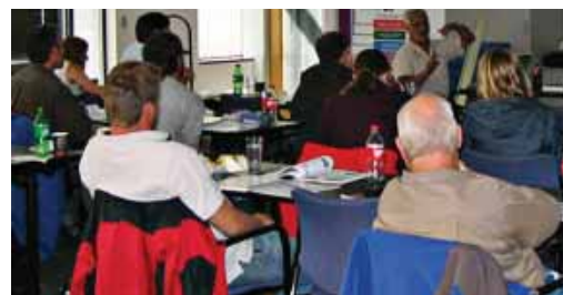
Rain water harvesting training offered by King County staff.

Representatives from Public Health–Seattle & King County supported efforts by Washington State to adopt an amendment to the plumbing code to allow rain water harvesting and other water reuse systems. Additionally, four plumbing code seminars that included information about this change were conducted. These seminars targeted Public Health–Seattle & King County staff, water purveyors, various county and city building department staff, designers and installers. These efforts were successful and significant achievements in 2010.