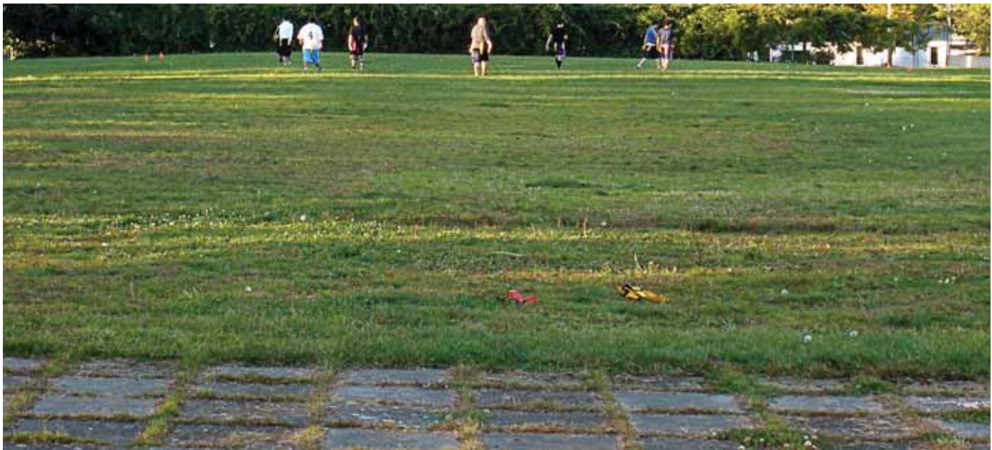
Green roof of North Base bus garage used by community as sports field.