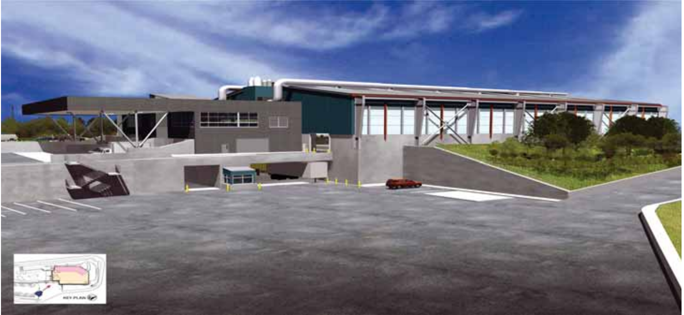
Architectural rendering of the Bow Lake Recycling and Transfer Station, with the goal of achieving LEED Gold.