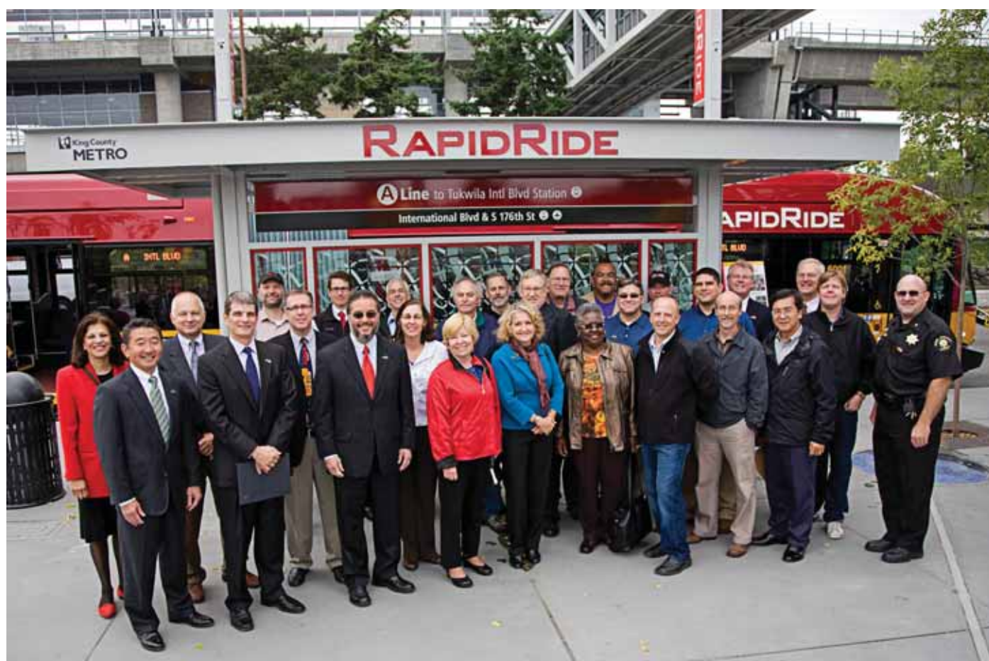
Metro Transit celebrates the grand opening of RapidRide A Line.