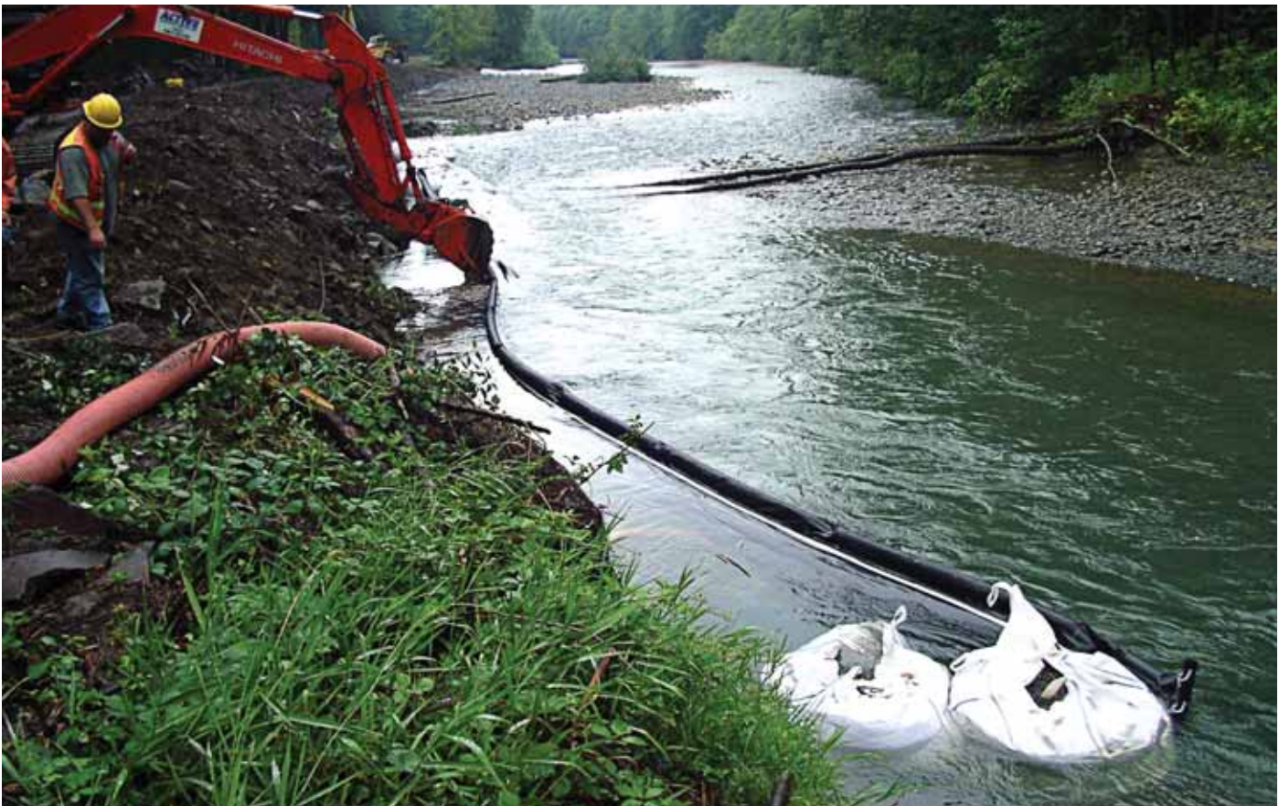
Contractor on Lower Tolt River Floodplain Reconnection Project provided excellent erosion and sediment control measures