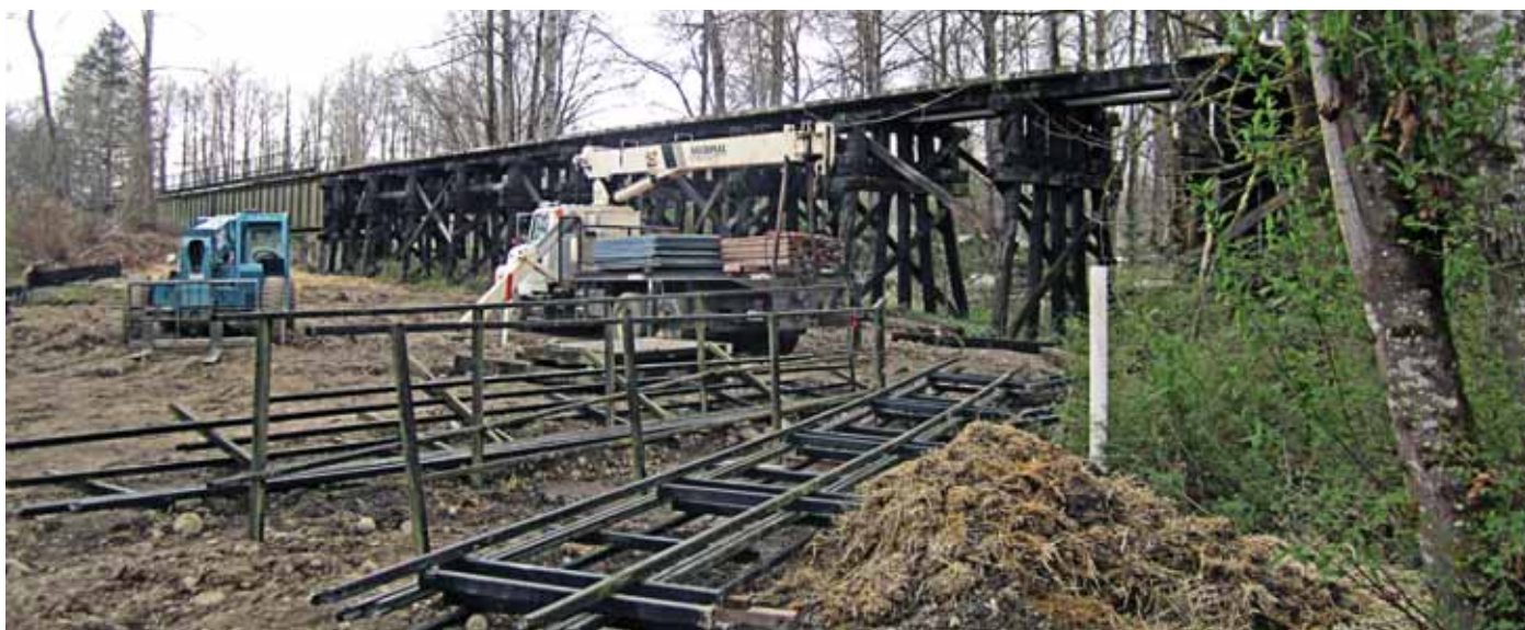
Deconstruction of Tolt River Bridge on Snoqualmie Valley Trail.