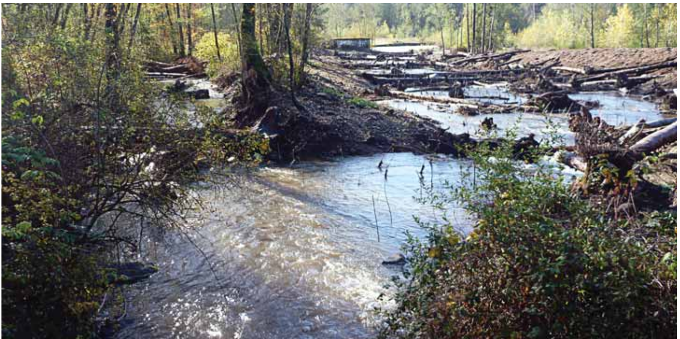
Lower Boise Creek Channel Restoration Project diverted 95 percent of C&D materials from landfill.