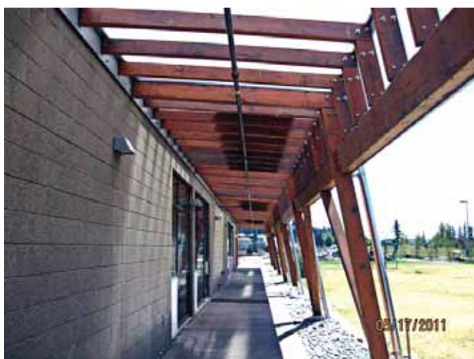
Rainwater harvesting system and reused salvaged timbers at the Brightwater Environmental Education & Community Center, with the goal of achieving LEED Gold.