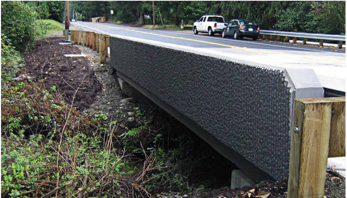
May Creek Bridge used fly ash in concrete mix.