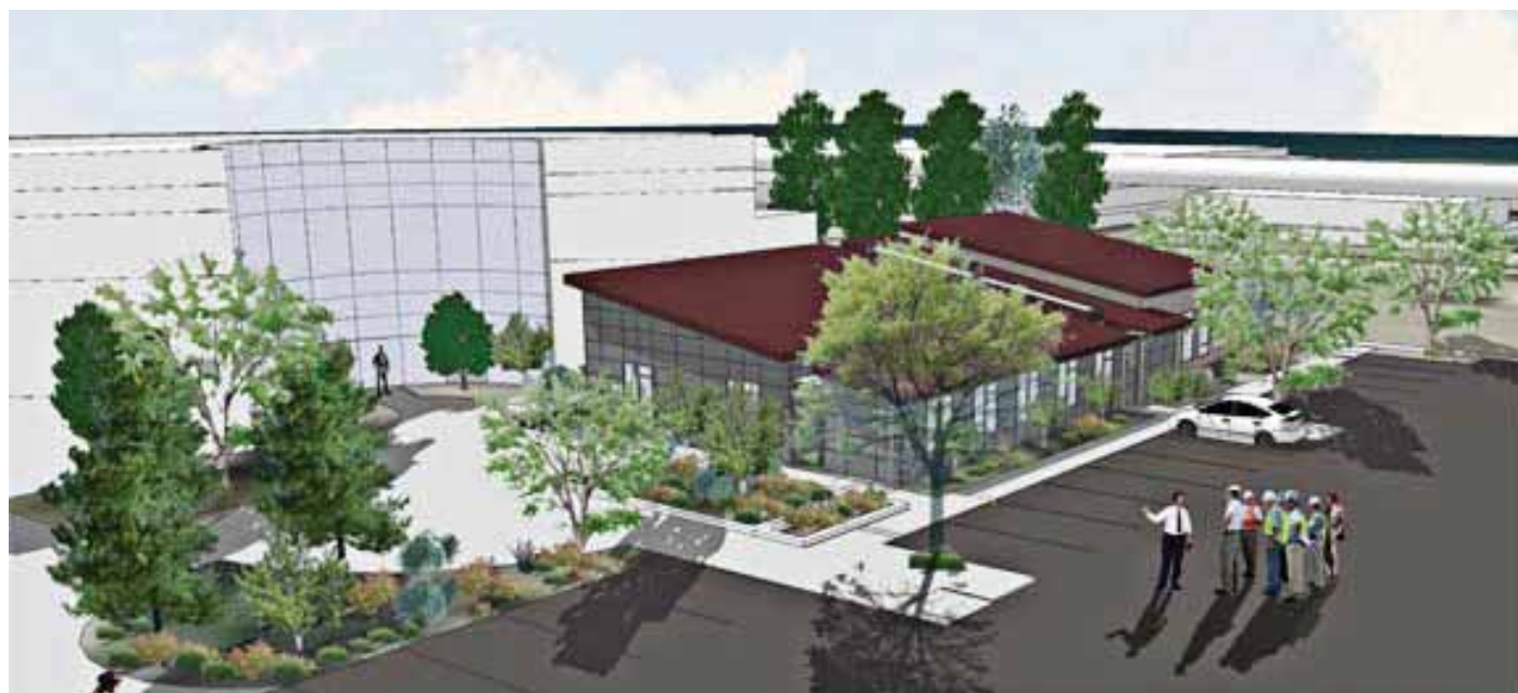
Architectural rendering of West Point Modular Office Annex.