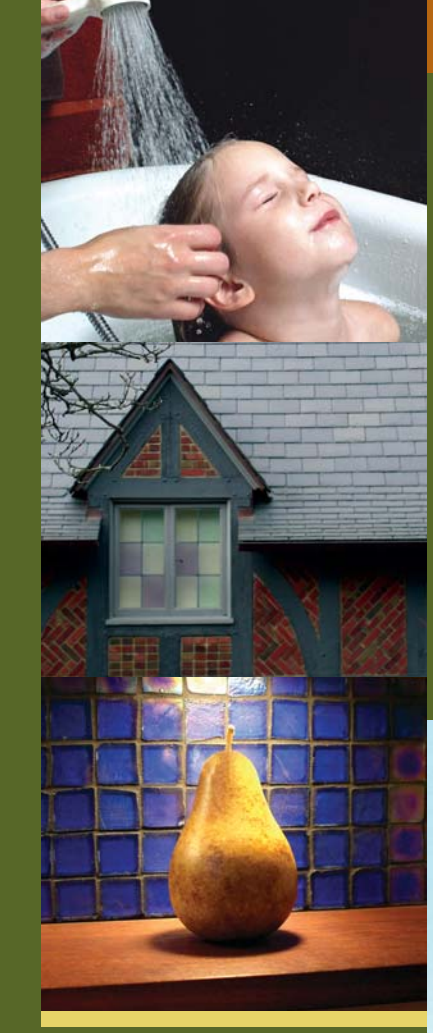
Photo third from top: Environmental Home Center. Photo bottom: Robert Harrison Architects.

This information can be made available on request to accommodate people with disabilities.