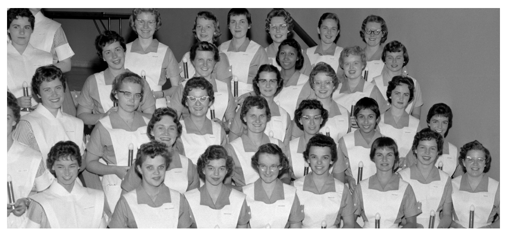
Graduation ceremony, Harborview Hall, early 1950s.