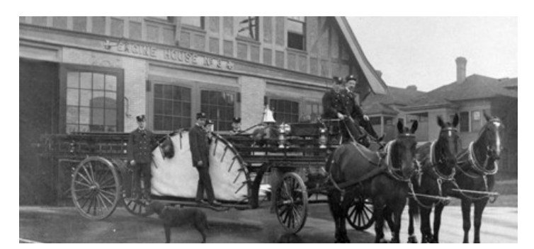
Ladder Company 3 with rescue net in 1904, the year Seattle Fire Station No. 3 opened. A motorized Engine 3 arrived in 1918. The fire station closed April 21, 1921.