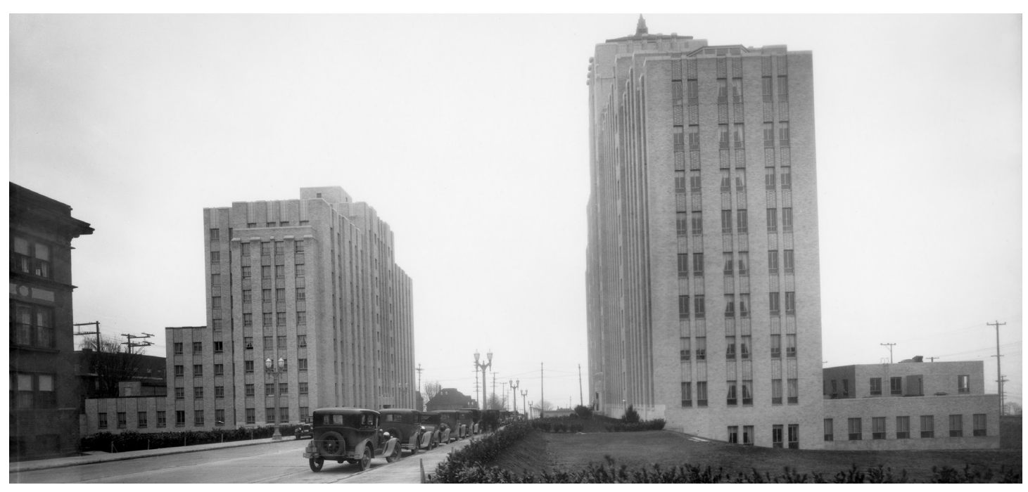
Harborview Hall is a smaller, less elaborate reflection of Harborview Hospital's architecture. They are connected by a tunnel. Photo taken in 1935; PEMCO Webster & Stevens Collection, Museum of History and Industry.