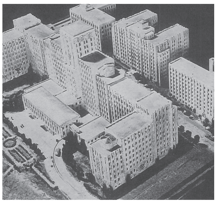
Voters approved $2.75 million in 1929 for a new King County hospital

The Harborview Hall adaptive reuse project offers a unique opportunity to preserve one of Seattle's remaining Art Deco treasures while at the same time preserving its cultural heritage role as a nursing residence in the founding years of the University Of Washington School Of Nursing. The building has the classic Art Deco façade proportions of verticality and bookend massing. Art Deco decorative elements at the building crown, building entry and lobby are key existing features that present design opportunities as the team moves forward establishing a new life for this underutilized facility. Additional design team goals include improved energy performance, seismic modernization, sustainable strategies, and flexible design infrastructure to meet the changing needs of today's building tenants. The new building will combine state-of-the-art capabilities with the qualities of classic design.