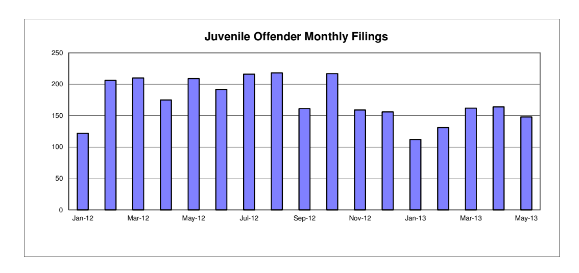
Figure 1. Number of Juvenile Offender Filings, Resolutions and Pending Caseload by Month