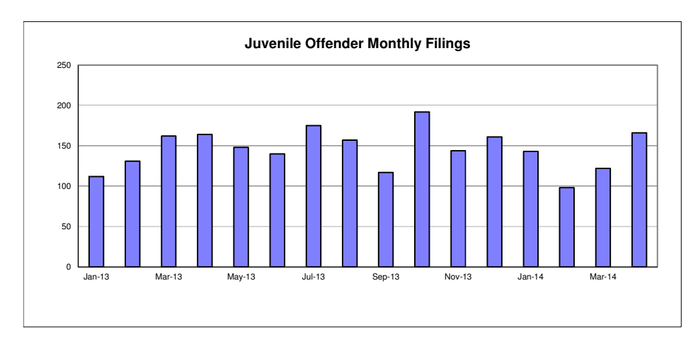
Figure 1. Number of Juvenile Offender Filings, Resolutions and Pending Caseload by Month