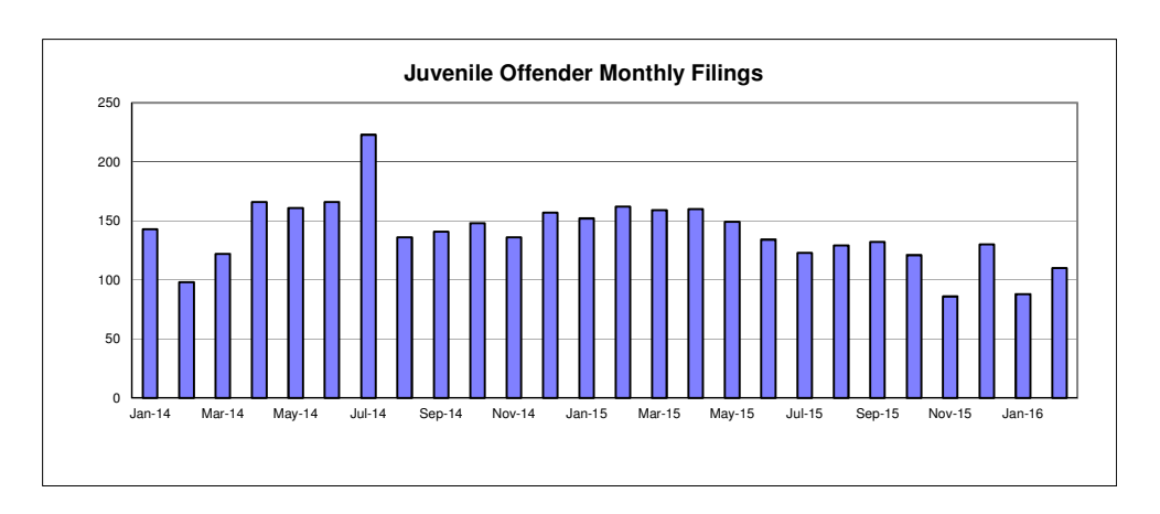
Figure 1. Number of Juvenile Offender Filings, Resolutions and Pending Caseload by Month