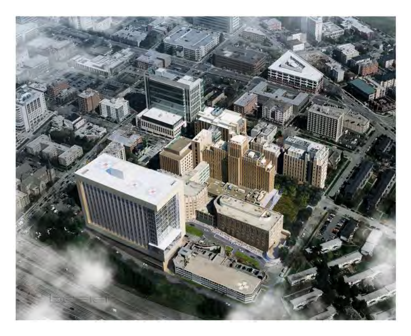
ILLUSTRATION IS A POINT IN TIME RENDERING PROVIDED FOR PLANNING PURPOSES