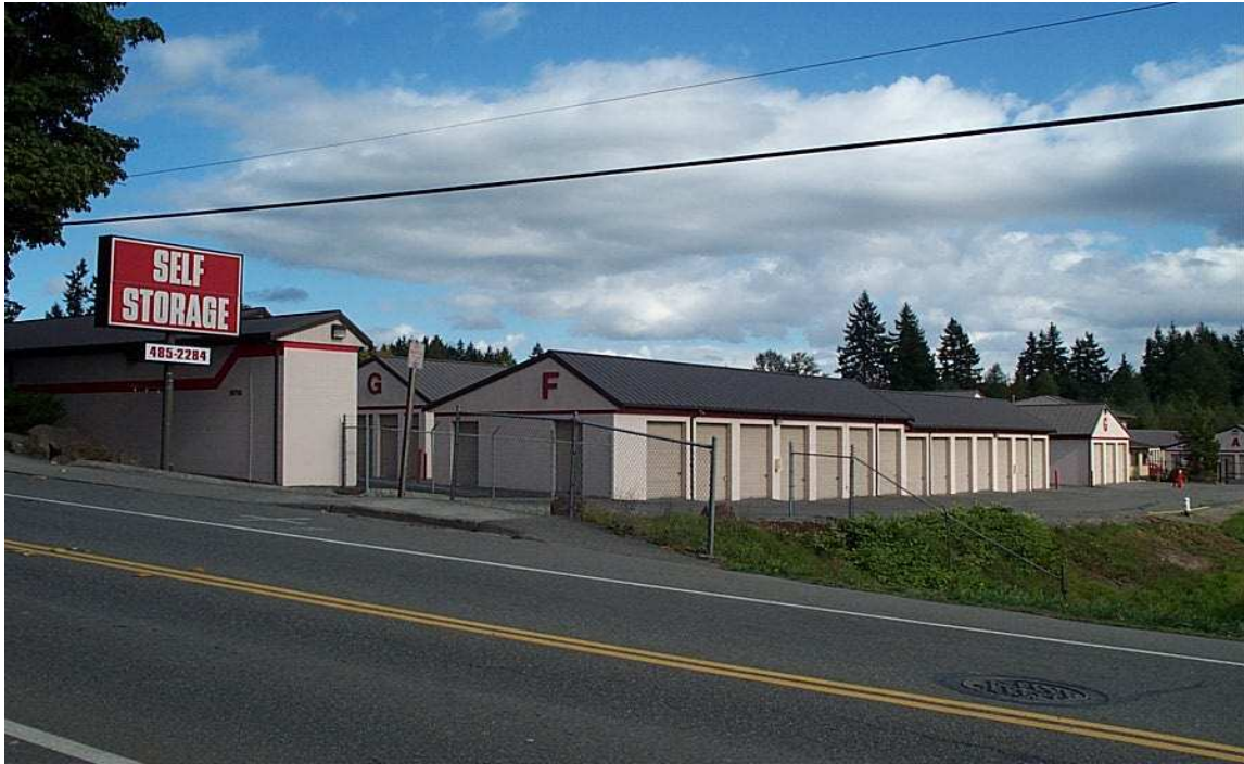
TYPICAL OLDER FACILITY – 18716 68 TH AVE NE, KENMORE