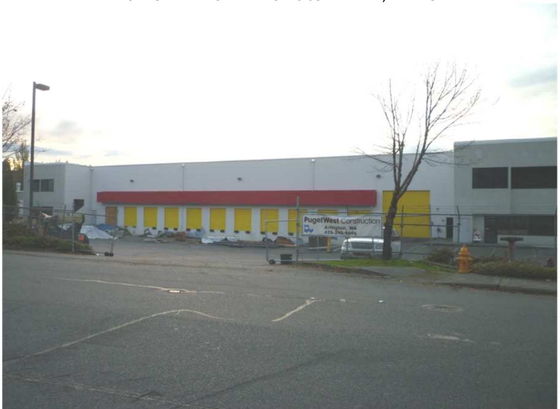
SUBURBAN WAREHOUSE CONVERSION – 7115 132 ND PL. SE, NEWCASTLE