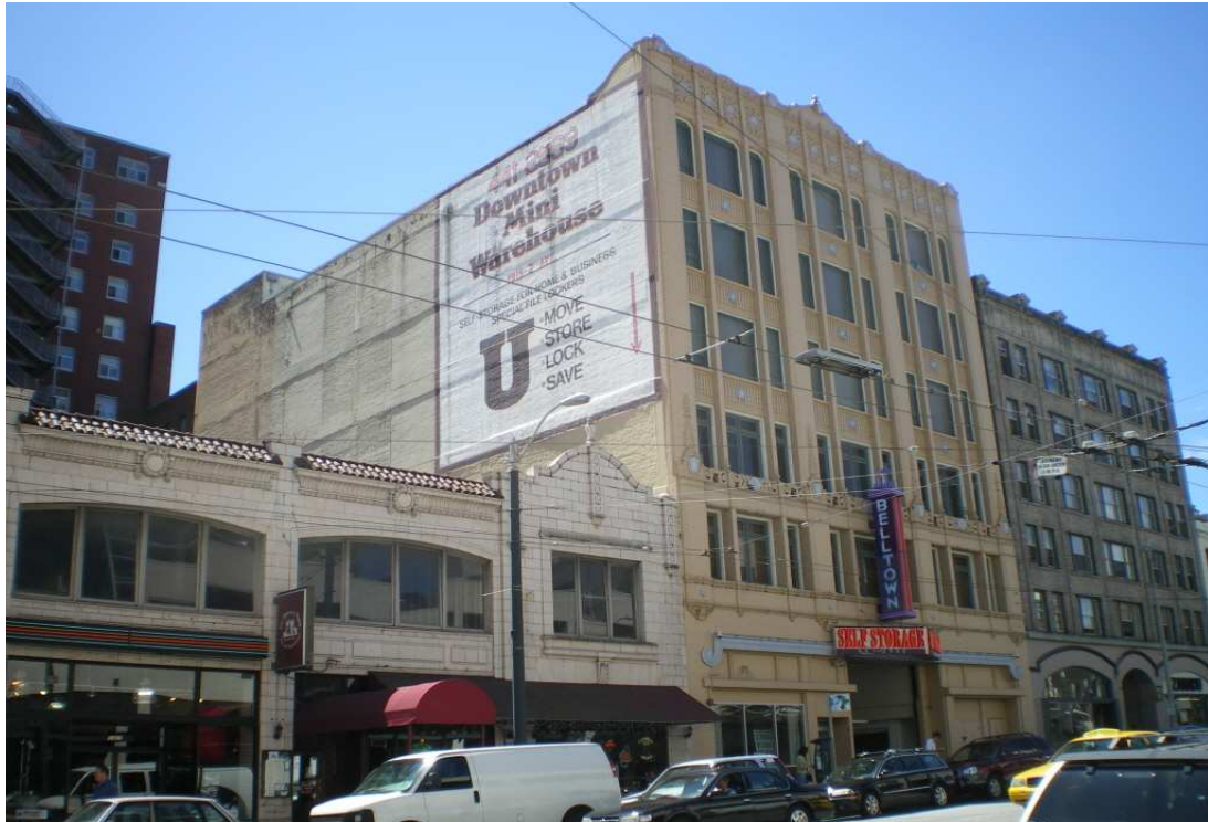
URBAN WAREHOUSE CONVERSION – 1915 3 RD AVE, SEATTLE