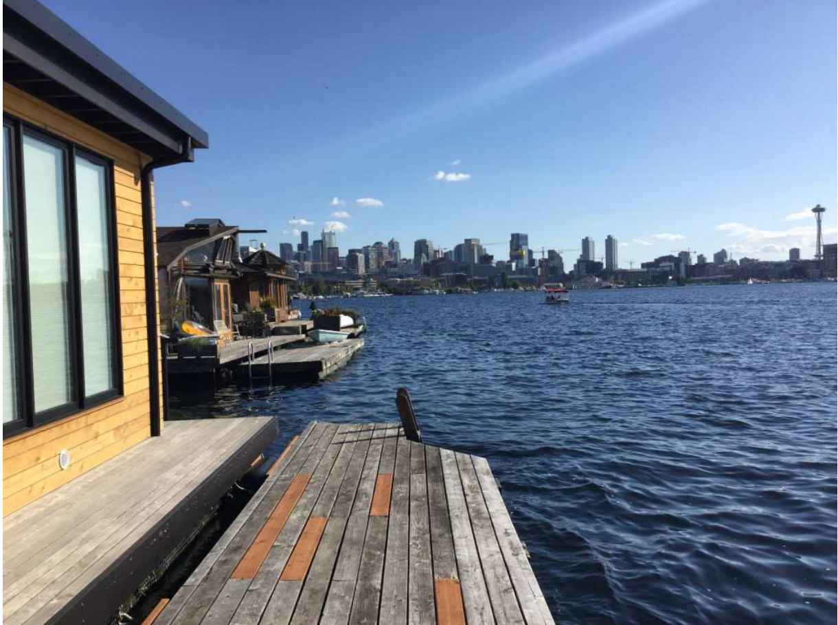
An end of the dock view at the Log Foundation dock in Eastlake.