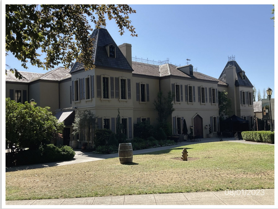
*Chateau St. Michelle