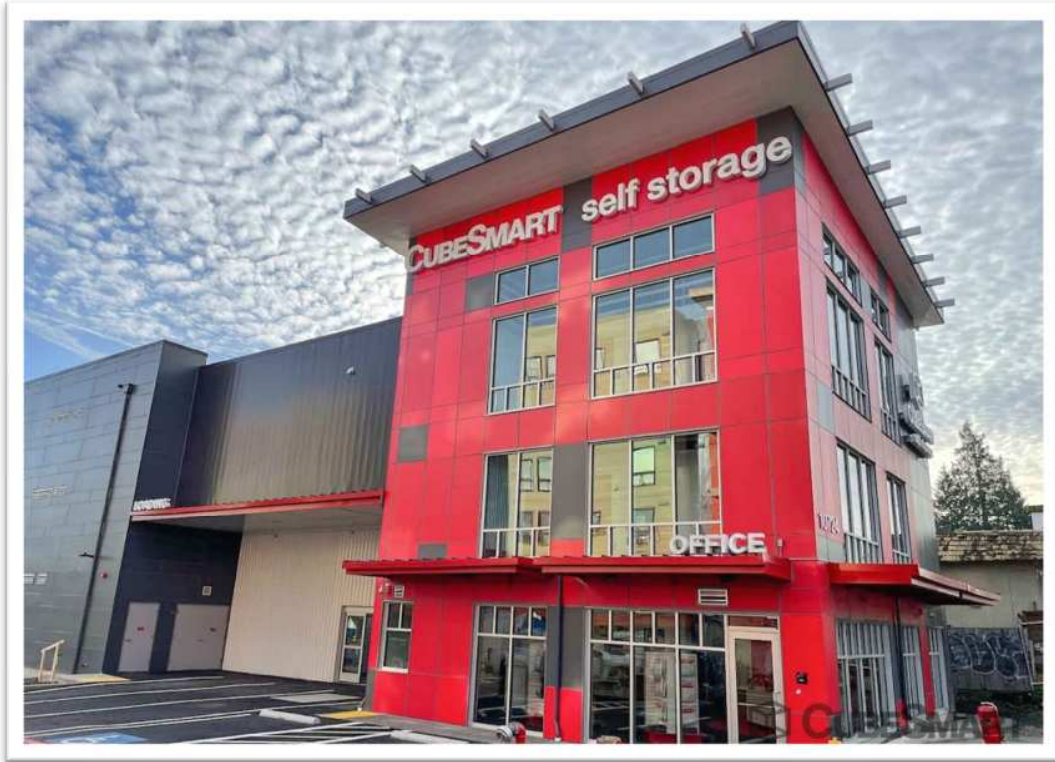
CUBESMART SELF-STORAGE SEATTLE