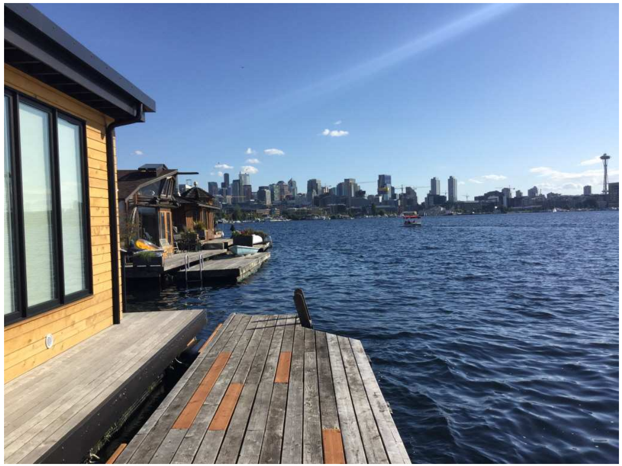
An end of the dock view at the Log Foundation dock in Eastlake.