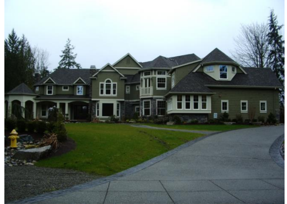
Grade 12/ Year Built 2007/ Total Living Area 7,640sf