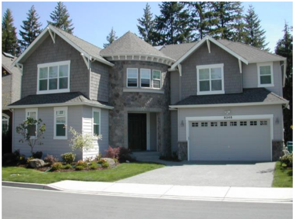
Grade 9/ Year Built 2003/ Total Living Area 3,480sf