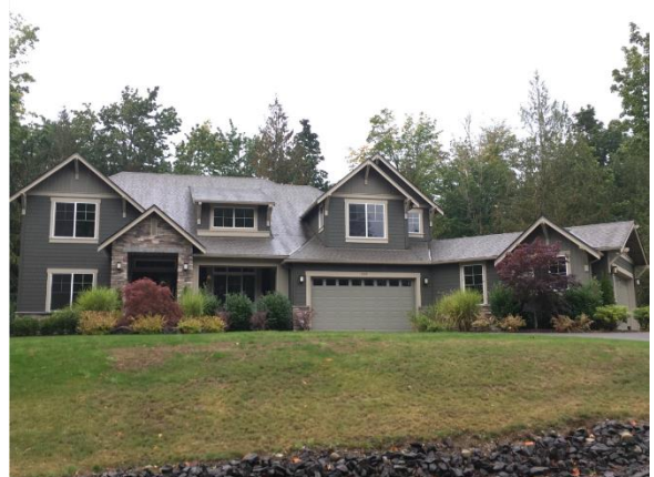
Grade 10/ Year Built 2014/ Total Living Area 4,910sf