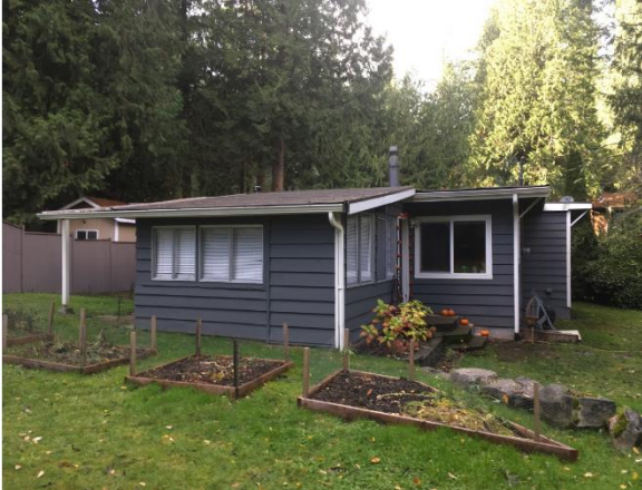
Grade 5/ Year Built 1964/ Total Living Area 1,060sf