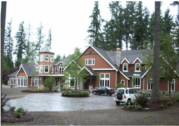
Grade 13 /Year Built 2004/ Total Living Area 10,380sf