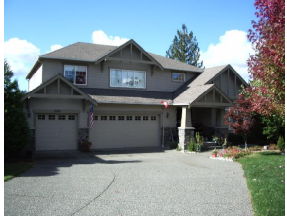
Grade 8/ Year Built 2000/ Total Living Area 2,790sf