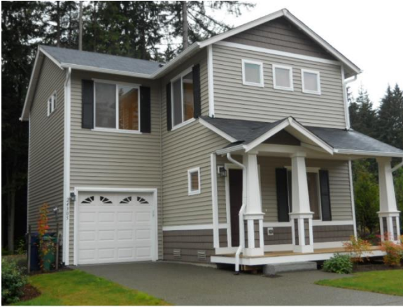
Grade 7/ Year Built 2010/ Total Living Area 1,460sf