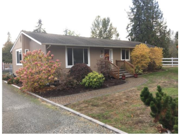
Grade 6/ Year Built 1988/ Total Living Area 1,460sf