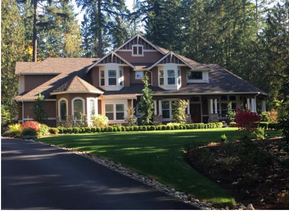
Grade 11/ Year Built 2011/ Total Living Area 4,580sf