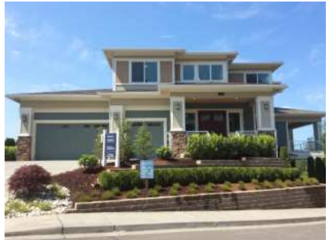
Grade 11/ Year Built 2014/ Total Living Area 4,460sf