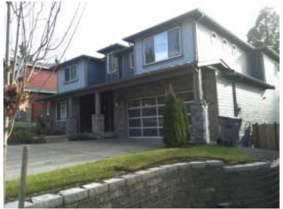
Grade 9/ Year Built 2018/ Total Living Area 4,000sf