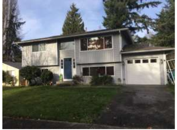
Grade 7/ Year Built 1973/ Total Living Area 1,660sf