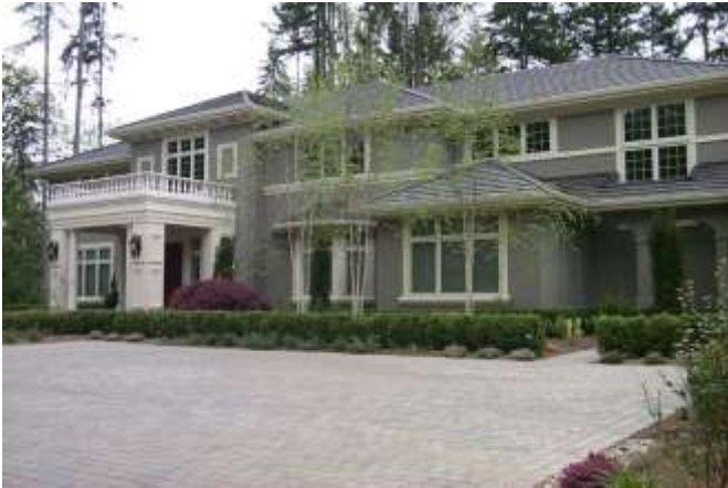
Grade 12/ Year Built 2008/ Total Living Area 8,090sf