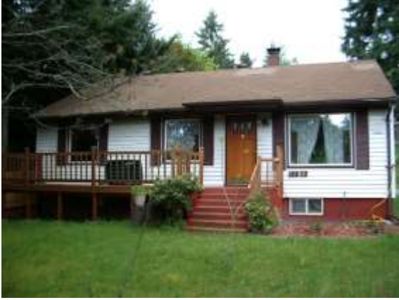
Grade 6/ Year Built 1939/ Total Living Area 2,270sf