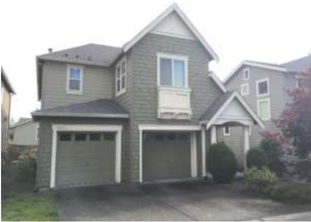
Grade 8/ Year Built 2008/ Total Living Area 2,520sf