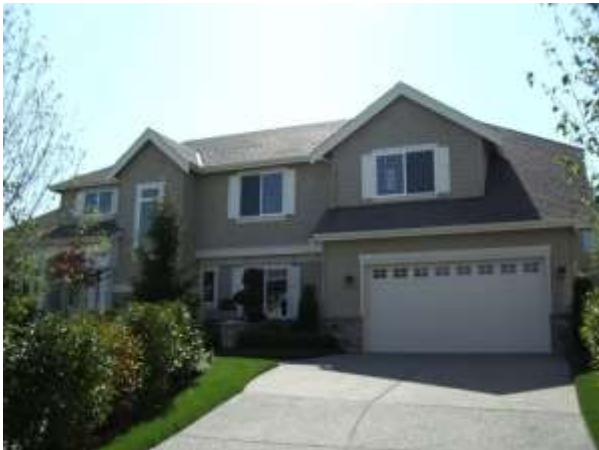
Grade 10/ Year Built 2006/ Total Living Area 3,210sf