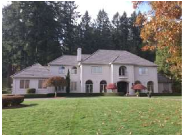
Grade 13/ Year Built 1990/ Total Living Area 5,870sf