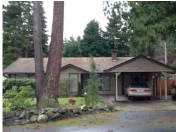
Grade 7/Year Built 1955/ Parcel # 326230-0495