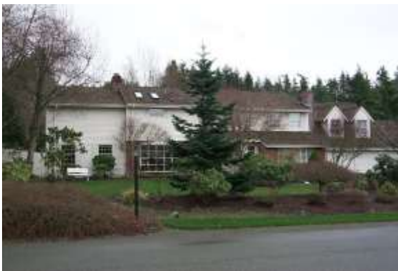
Grade 10/ Year Built 1977/ Parcel # 164800-0040