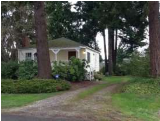
Grade 6/Year Built 1946/ Parcel # 326230-0840