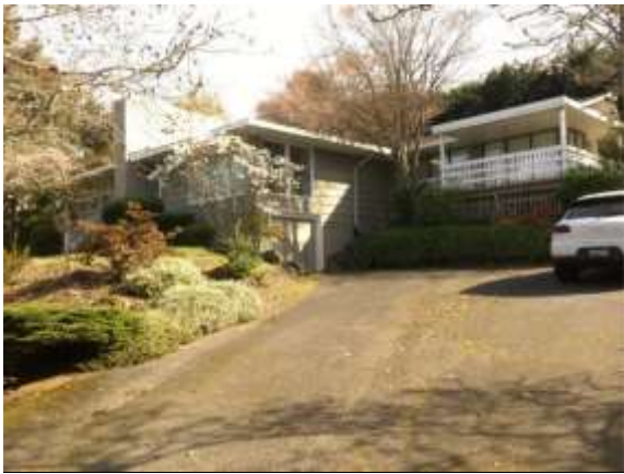
Grade 8/ Year Built 1947/ Parcel # 201870-0170