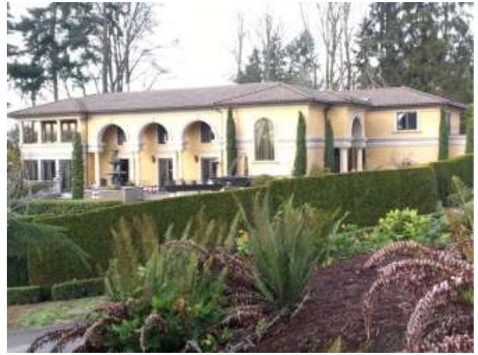
Grade 13/ Year Built 2005/ Parcel # 644860-0180