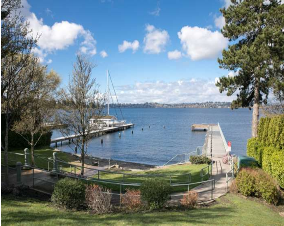
Town of Yarrow Point, yarrowpointwa.gov