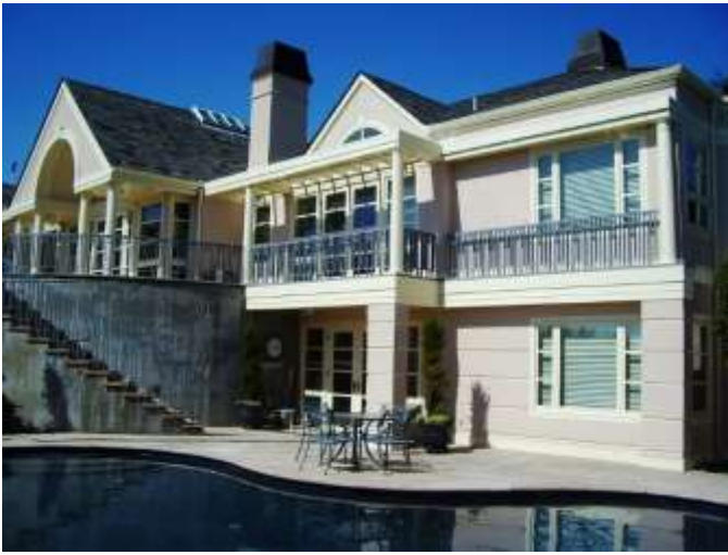
Grade 12/ Year Built 1990/ Parcel # 546130-0050