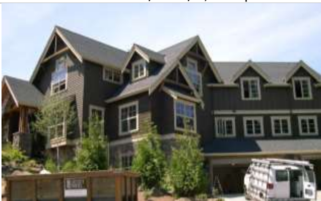
Grade 12/ 2007/ 5,990 sq ft