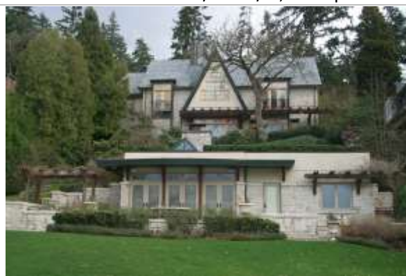
Grade 13/ 1999/ 5,580 sq ft