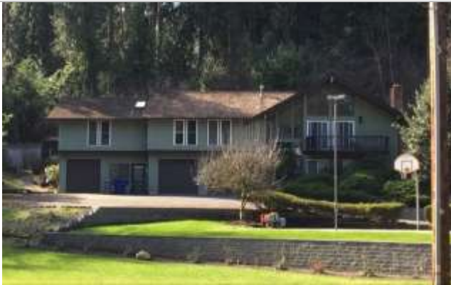
Grade 8/ 1975/ 3,360 sq ft