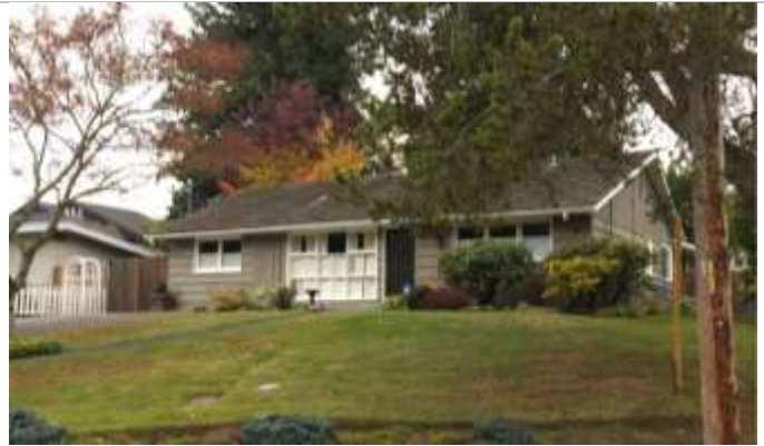
Grade 7/ 1954/ 1,470 sq ft