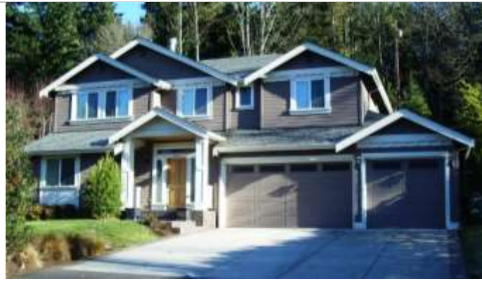
Grade 9/ 2005/ 2,690 sq ft