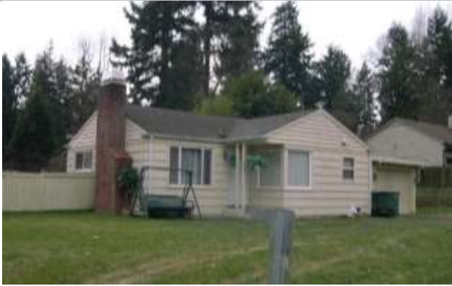
Grade 6/ 1950/ 1,350 sq ft