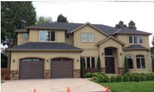
Grade 10/ 2013/ 4,285 sq ft