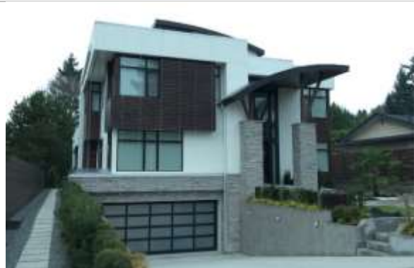
Grade 11/ 2018/ 4,950 sq ft