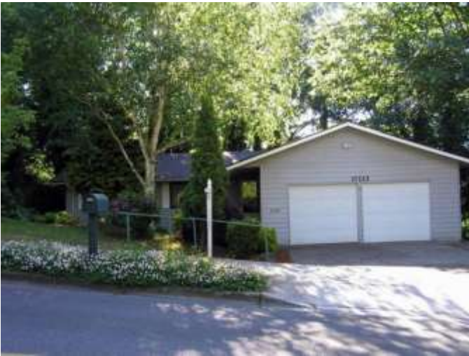
Grade 7/ Year Built 1977/ TLA 1,270sf