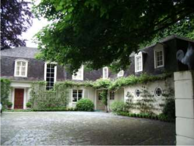
Grade 11/ Year Built 1938/ TLA 6,280sf