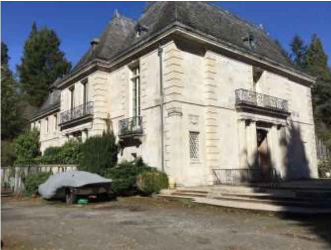
Grade 13/ Year Built 1931/ TLA 11,090sf