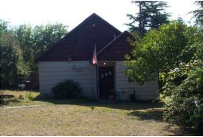
Grade 5/ Year Built 1947/ TLA 660sf