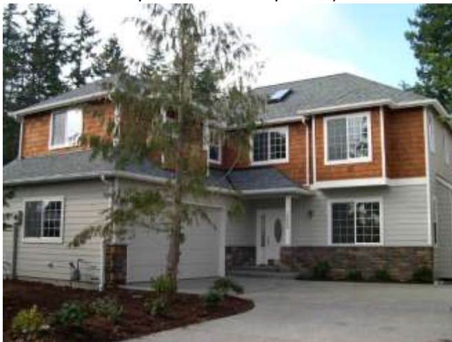
Grade 9/ Year Built 2003/ TLA 2,610sf