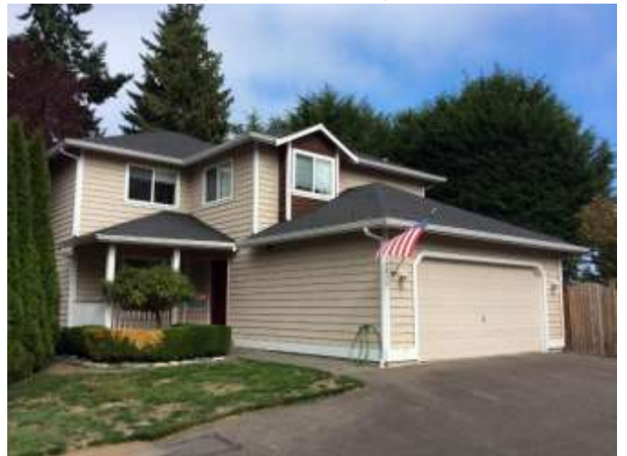
Grade 8/ Year Built 1999/ TLA 2,270sf