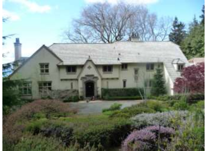
Grade 12/ Year Built 1921/ TLA 8,220sf