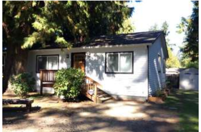
Grade 6/ Year Built 1934/ TLA 950sf