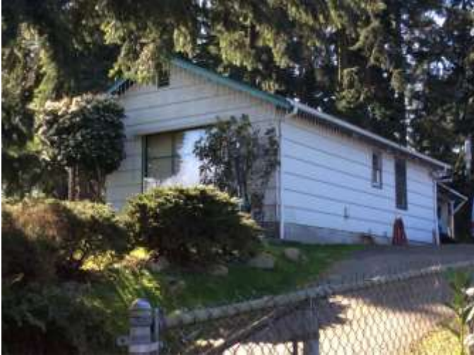
Grade 5/ Year Built 1947/ Total Living Area 590sf