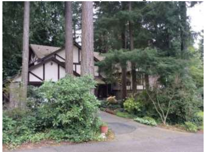
Grade 10/ Year Built 1980/ Total Living Area 4,310sf