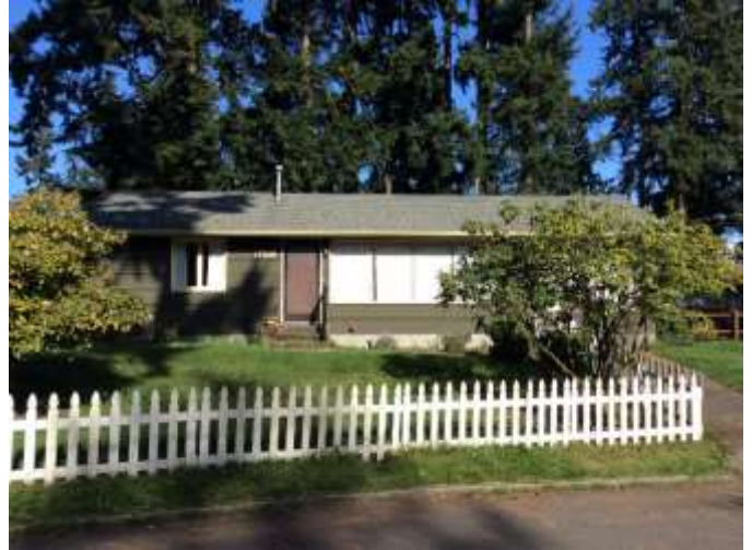
Grade 6/ Year Built 1951/ Total Living Area 1,030sf