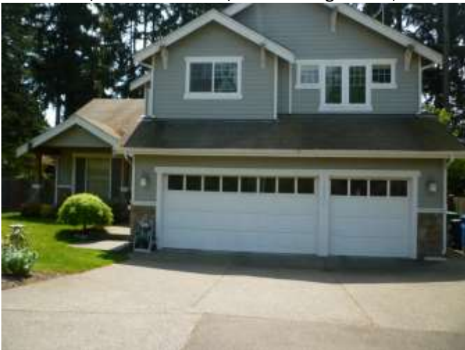
Grade 9/ Year Built 2005/ Total Living Area 2,710sf