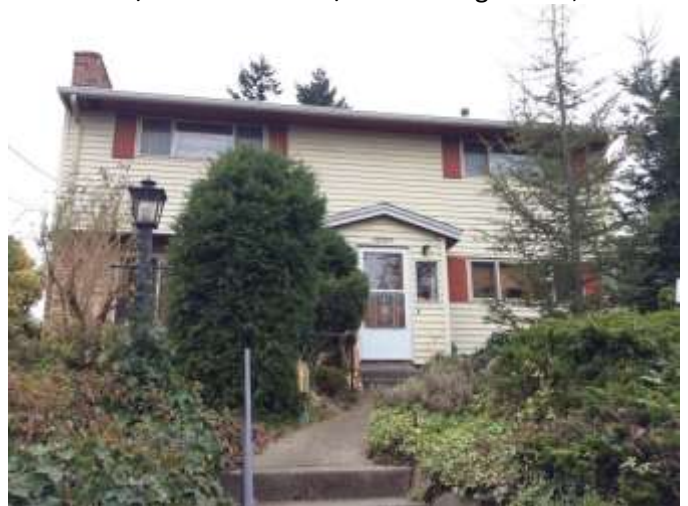
Grade 8/ Year Built 1959/ Total Living Area 2,220sf