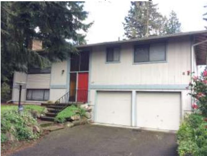
Grade 7/ Year Built 1969/ Total Living Area 1,730sf