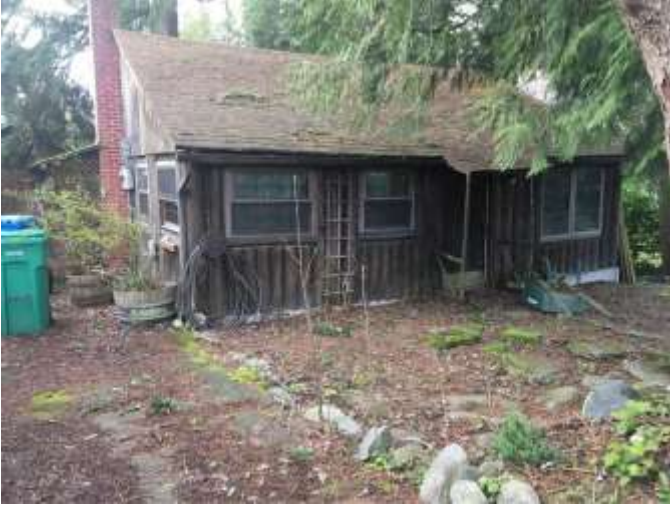
Grade 5/ Year Built 1939/ Total Living Area 690sf