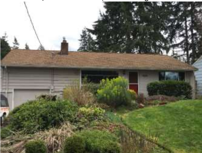
Grade 7/ Year Built 1955/ Total Living Area 1,340sf