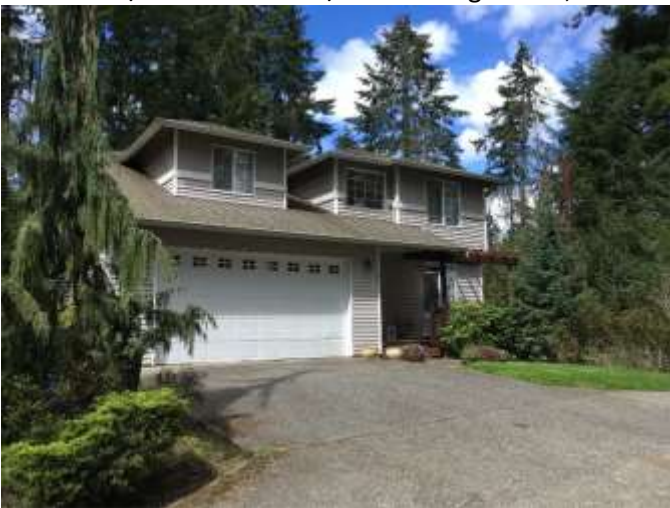
Grade 9/ Year Built 1999/ Total Living Area 3,310sf