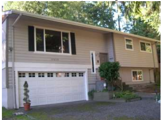
Grade 8/ Year Built 1978/ Total Living Area 2,260sf