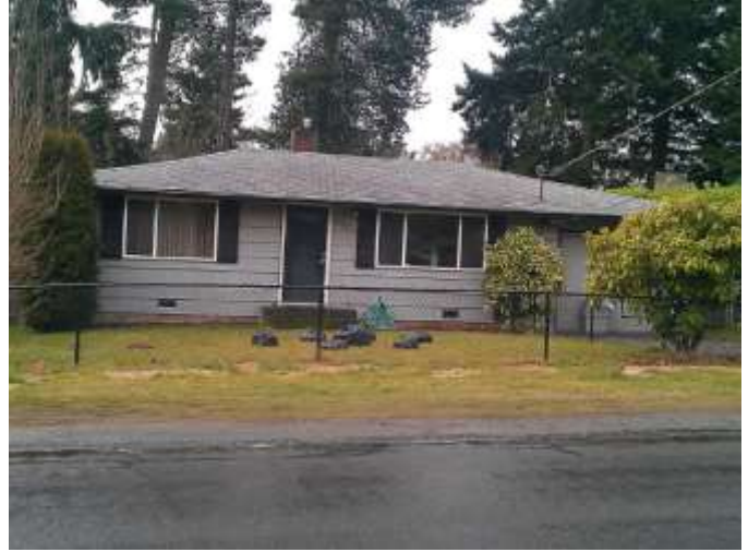
Grade 6/ Year Built 1951/ Total Living Area 830sf