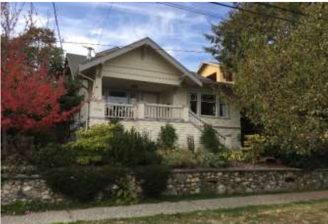
Grade 7/ Year Built 1920/ Total Living Area 2,450 sf