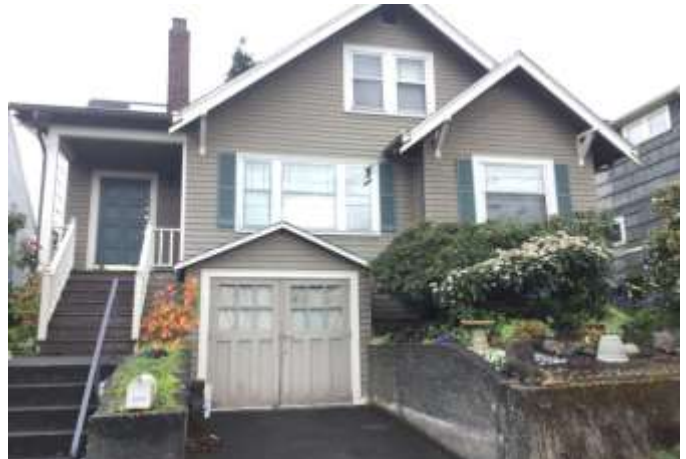
Grade 8/ Year Built 1927/ Total Living Area 1,660 sf