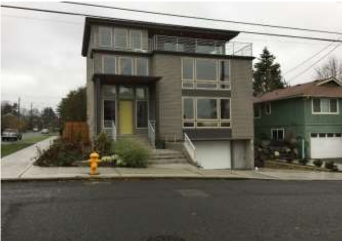
Grade 9/ Year Built 2016/ Total Living Area 4,690 sf