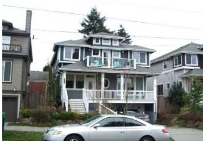
Grade 10/ Year Built 2006/ Total Living Area 3,520 sf