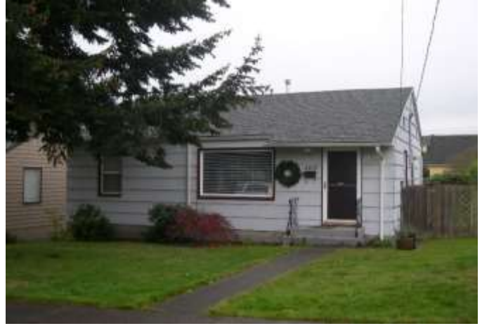
Grade 6/ Year Built 1943/ Total Living Area 770 sf