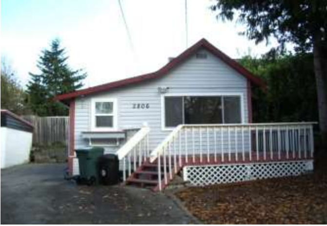
Grade 5/ Year Built 1928/ Total Living Area 420 sf