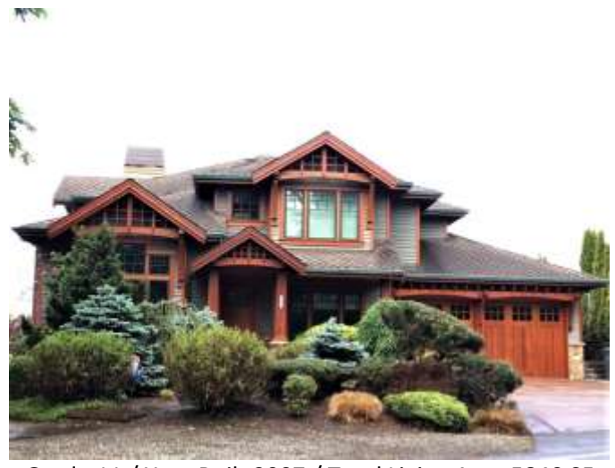
Grade 11 / Year Built 2007 / Total Living Area 5840 SF