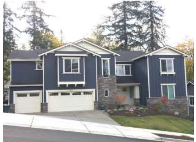
Grade 9/ Year Built 2018 / Total Living Area 3670 SF