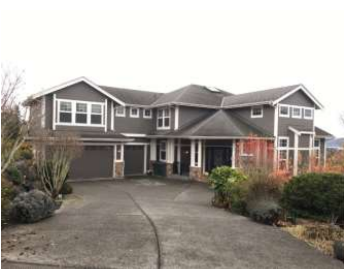
Grade 10 / Year Built 2004 / Total Living Area 5190 SF