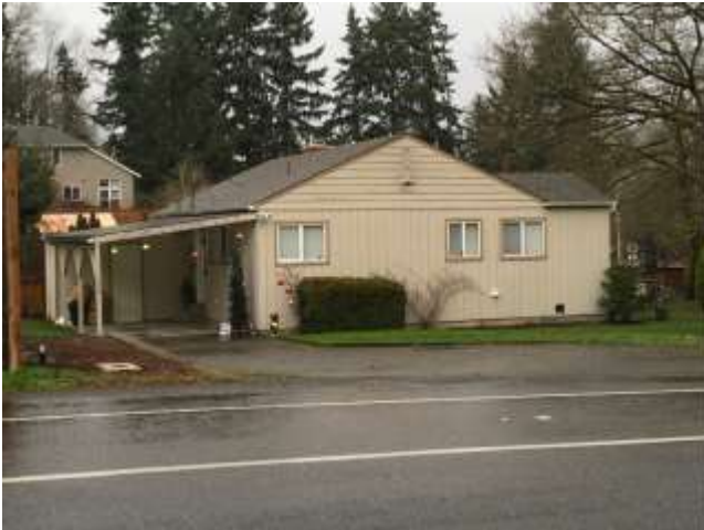
Grade 6 / 1965 Year Built / Total Living Area 890 SF