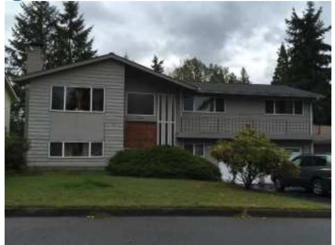
Grade 7/ Year Built 1968 / Totoal Living Area 1620 SF