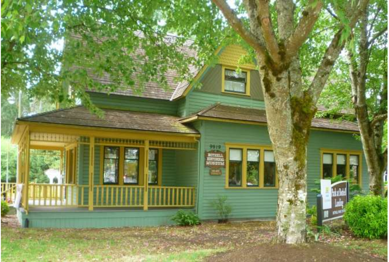
Bothell Historical Museum / Park at Bothell Landing