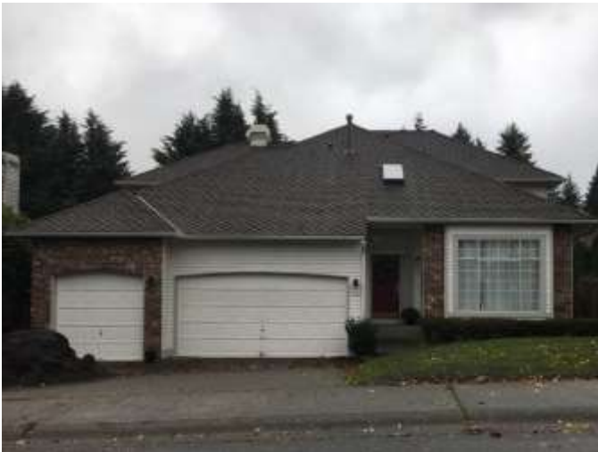
Grade 8 / Year Built 1993 / Total Living Area 2580 SF