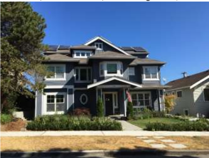
Grade 10/ Year Built 2016/ Total Living Area 4,030sf