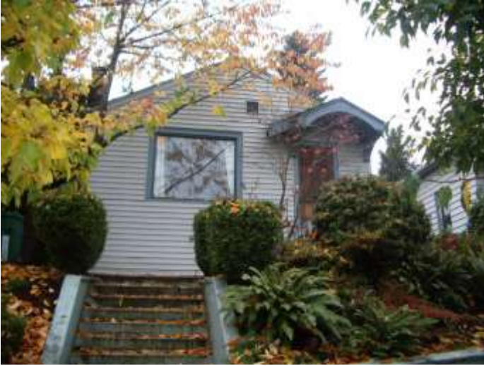
Grade 6/ Year Built 1914/ Total Living Area 920sf