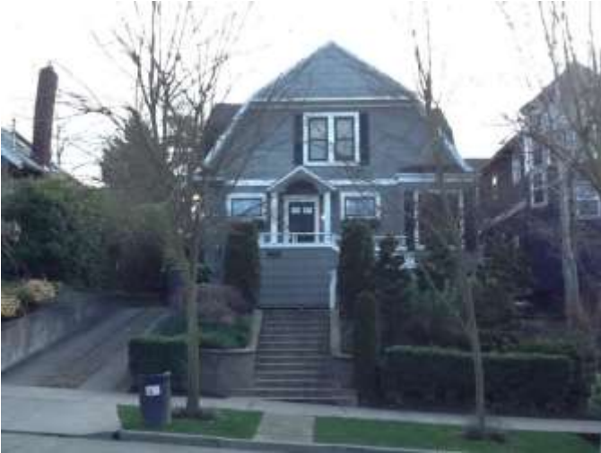
Grade 8/ Year Built 1907/ Total Living Area 3,250sf