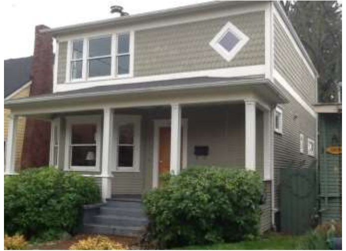
Grade 7/ Year Built 1918/ Total Living Area 2,410sf