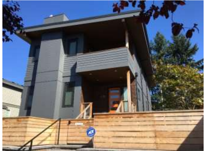
Grade 9/ Year Built 2016/ Total Living Area 3,640sf