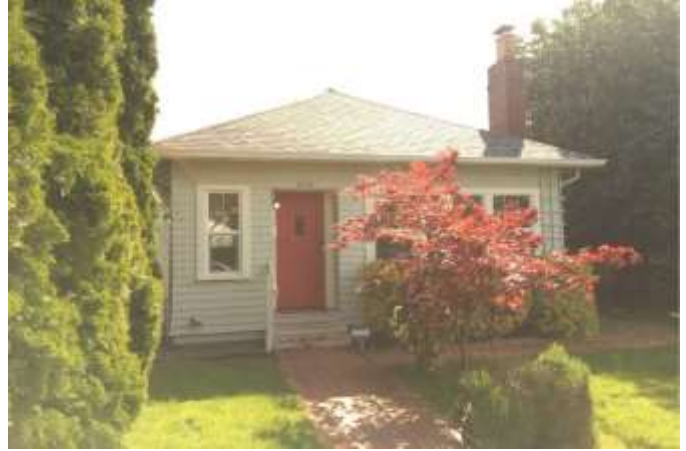
Grade 6/ Year Built 1909/ Total Living Area 850sf