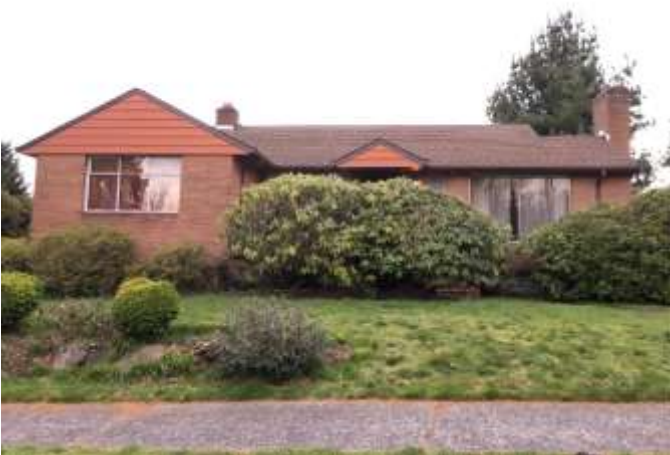
Grade 7/ Year Built 1951/ Total Living Area 1,420sf