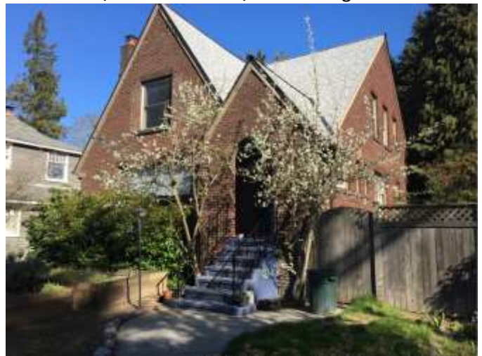
Grade 8/ Year Built 1929/ Total Living Area 2,190sf