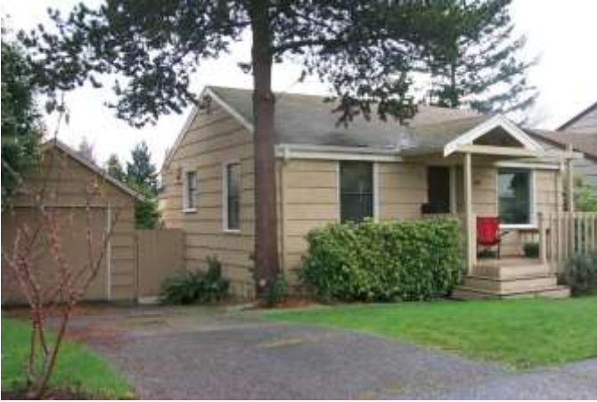
Grade 5/ Year Built 1947/ Total Living Area 520sf