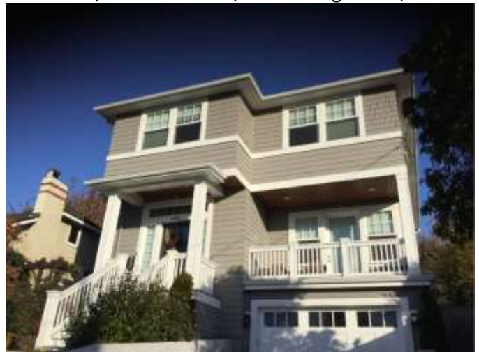
Grade 10/ Year Built 2017/ Total Living Area 3,620