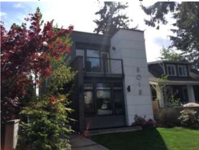
Grade 9/ Year Built 2013/ Total Living Area 2,740sf