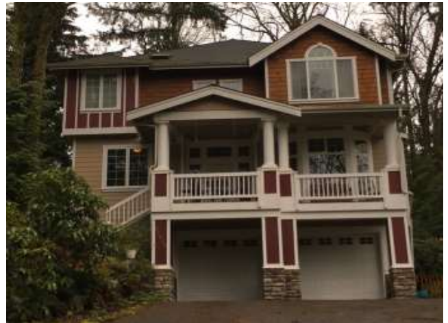
Grade 9 /Year Built 2006/ Total Living Area 3020