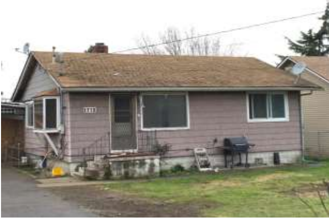
Grade 5/ Year Built 1943/ Total Living Area 720