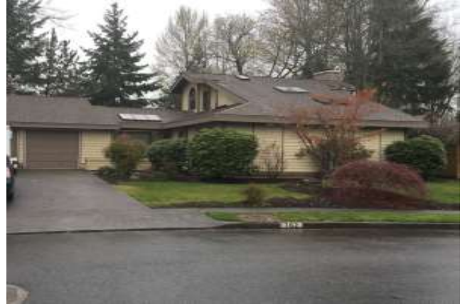
Grade 8/ Year Built 1969/ Total Living Area 2100