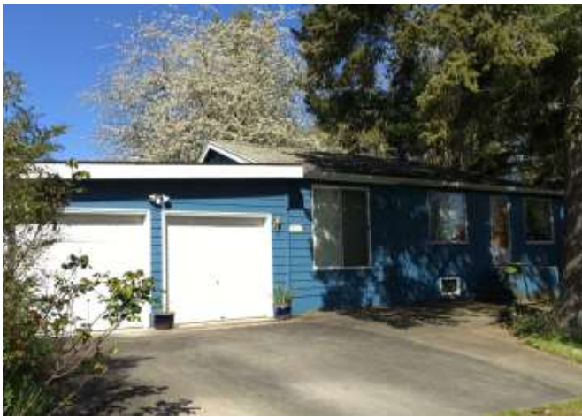
Grade 6/ Year Built 1947/ Total Living Area 1090