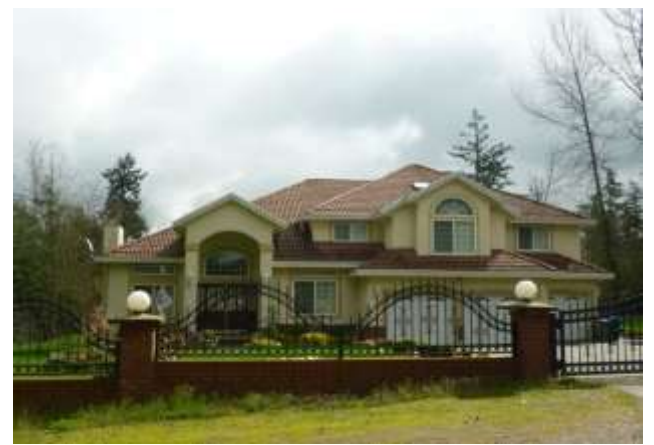
Grade 10/ Year Built 2001/Total Living Area 3570