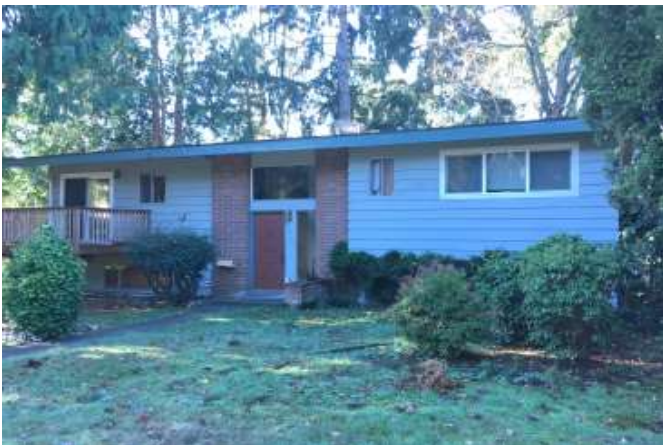
Grade 7/ Year Built 1964/ Total Living Area 1860