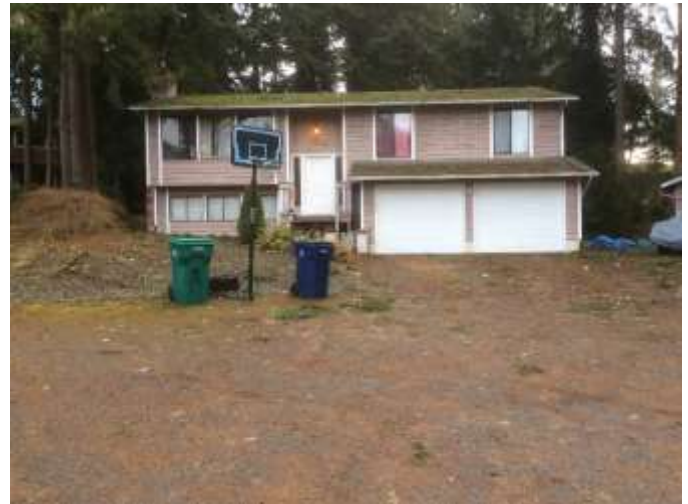
Grade 7/ Year Built 1978/ Total Living Area 2,020sf