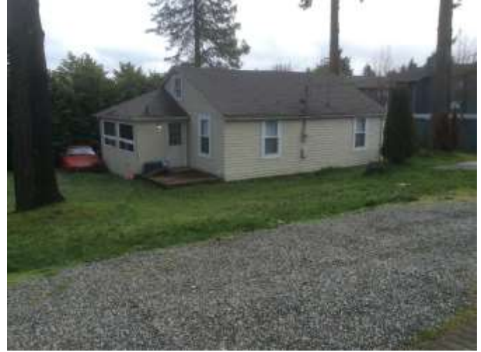
Grade 5/ Year Built 1945/ Total Living Area 800sf