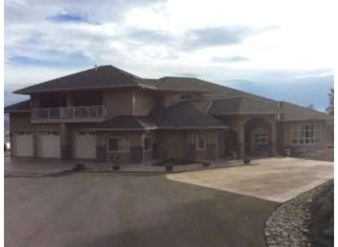
Grade 11/ Year Built 2007/ Total Living Area 5,440sf