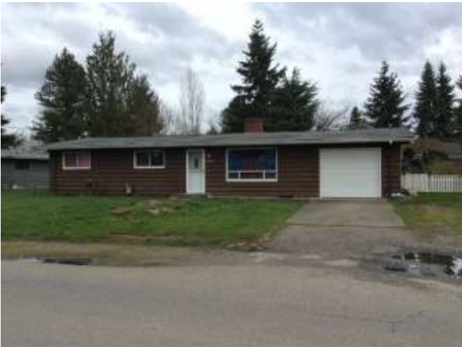
Grade 6/ Year Built 1957/ Total Living Area 1,140sf