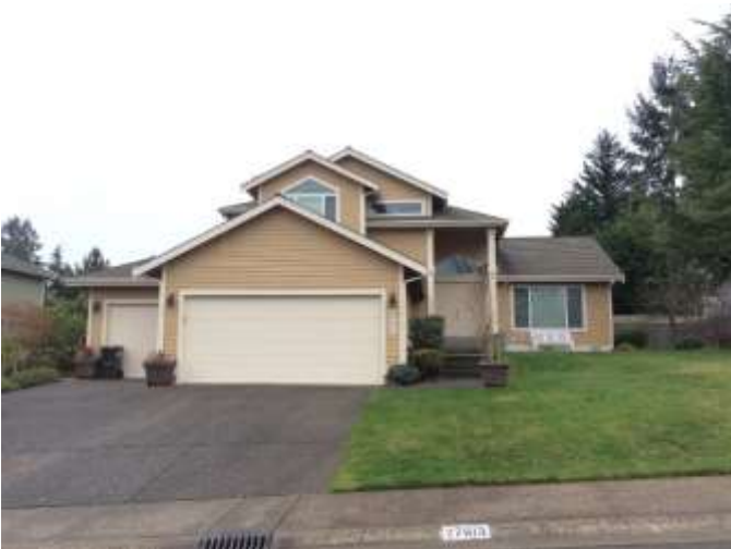
Grade 8/ Year Built 1993/ Total Living Area 2,140sf