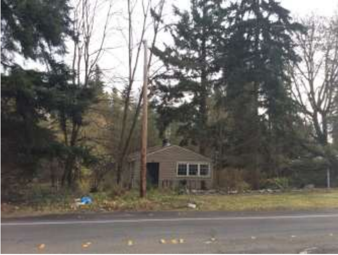
Grade 4/ Year Built 1948/ Total Living Area 600sf