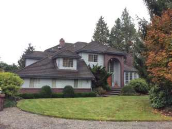
Grade 10/ Year Built 1990/ Total Living Area 3,920sf