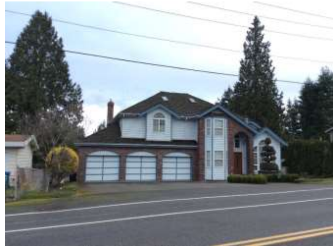
Grade 9/ Year Built 1995/ Total Living Area 2,730sf