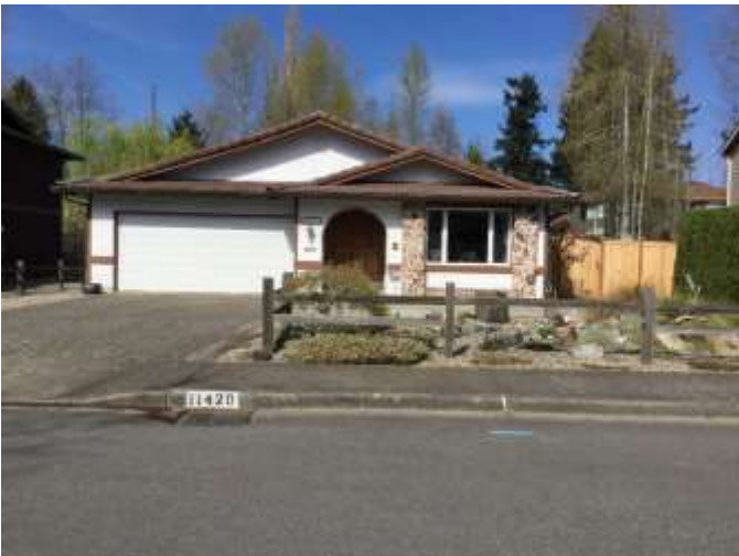
Grade 7/Year Built 1981/Total Living Area 1730 SF