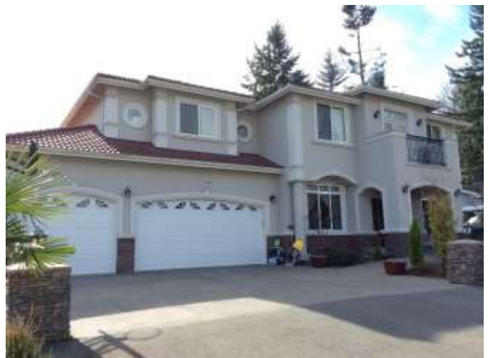
Grade 10/Year Built 2007/Total Living Area 4190 SF