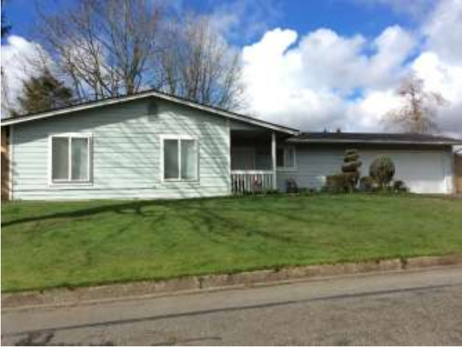
Grade 6/ Year Built 1976/Total Living Area 1170 SF