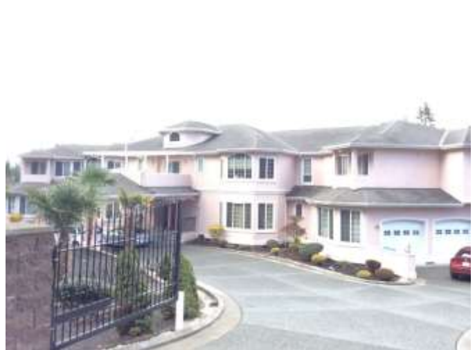
Grade 11/Year Built 2003/Total Living Area 12,170 SF