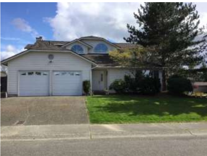
Grade 8/Year Built 1990/Total Living Area 2190 SF