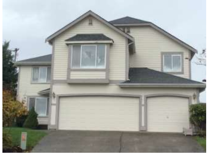
Grade 9/Year Built 1998/Total Living Area 2540 SF