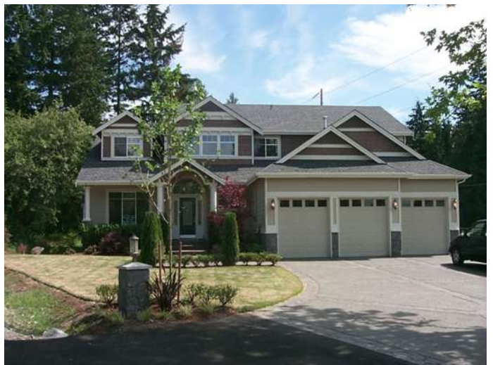
Grade 10/ Year Built 2002/ Total Living Area 3460