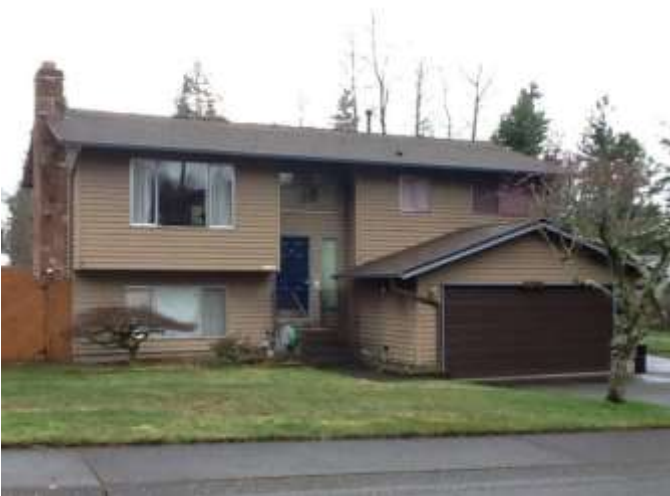
Grade 7/ Year Built 1979/ Total Living Area 1760