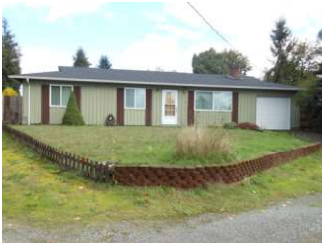
Grade 6/ Year Built 1968/ Total Living Area 1010