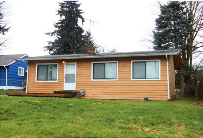
Grade 5/ Year Built 1941/ Total Living Area 910