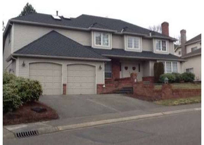
Grade 9/ Year Built 1992/ Total Living Area 3440