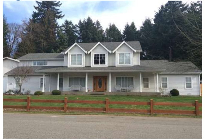
Grade 8/ Year Built 1999/ Total Living Area 3860