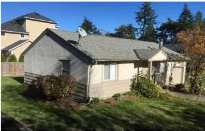
Grade 6/ Year Built 1955/ TLA 950