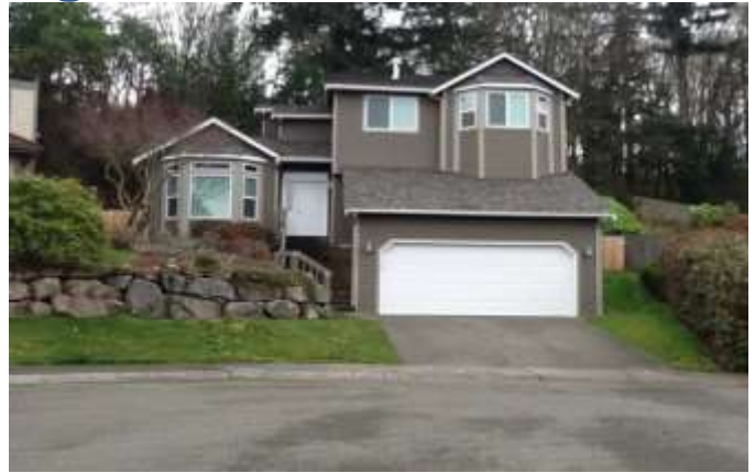
Grade 8/ Year Built 1980/ TLA 1,730