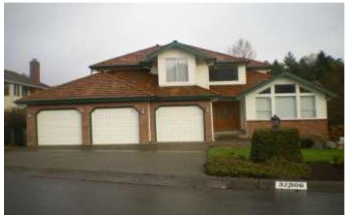
Grade 9/ Year Built 1990/ TLA 3,890