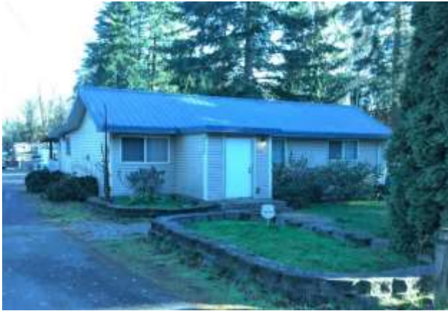
Grade 5/ Year Built 1942/ TLA 1,060