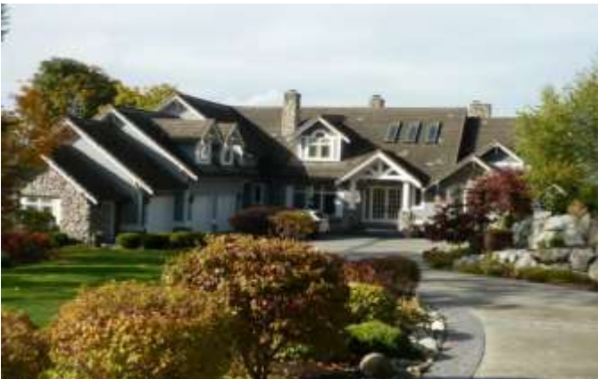
Grade 13/ Year Built 2000/ TLA 5,580