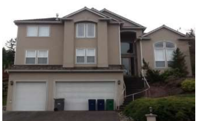
Grade 10/ Year Built 1999/ TLA 3,670