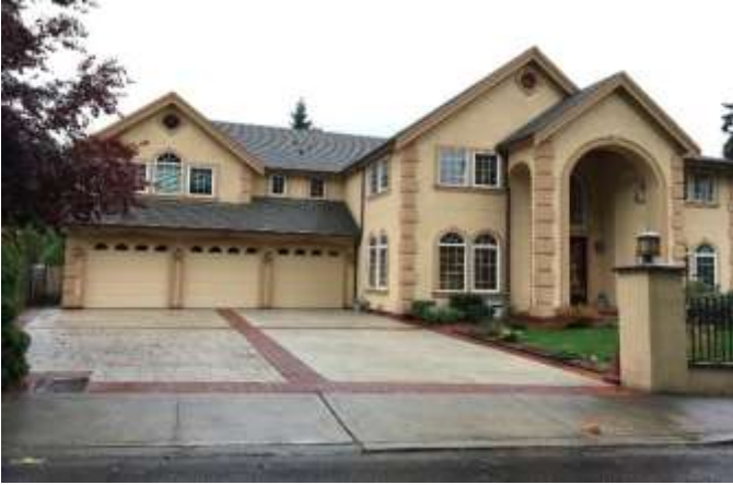
Grade 11/ Year Built 2006/ TLA 4,570