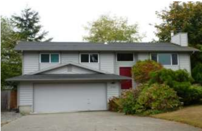
Grade 7/ Year Built 1980/ TLA 1,820