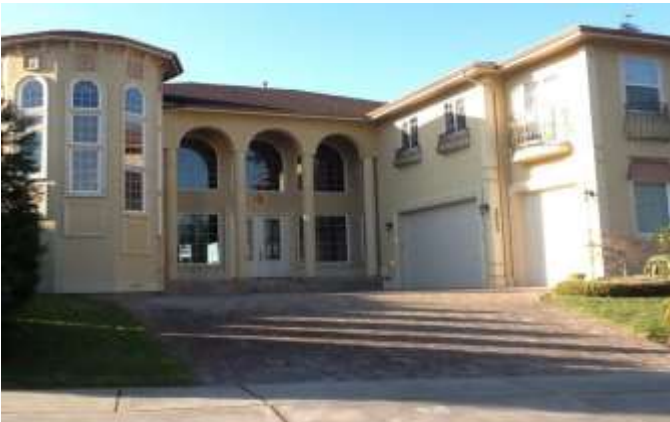
Grade 12/ Year Built 2006/ TLA 5,842