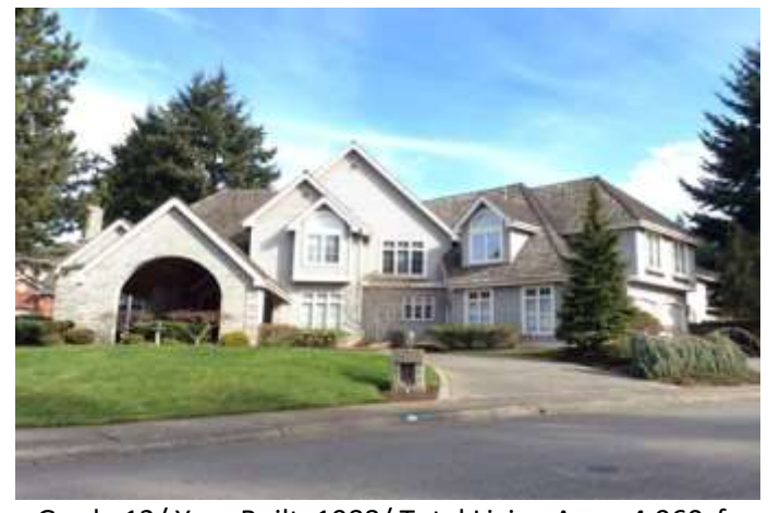
Grade 12/ Year Built: 1988/ Total Living Area: 4,960sf