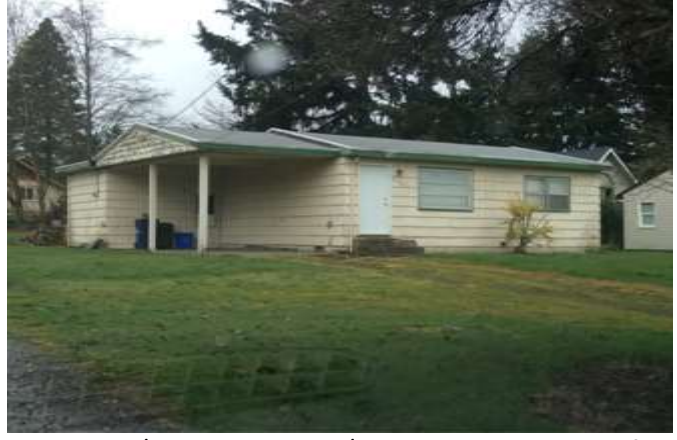
Grade 5/ Year Built: 1955/ Total Living Area: 910sf