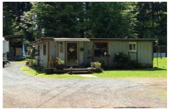
Grade 4/ Year Built: 1964/ Total Living Area: 930sf