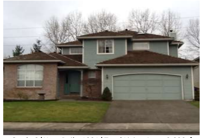
Grade 8/ Year Built: 1991/ Total Living Area: 2,030sf