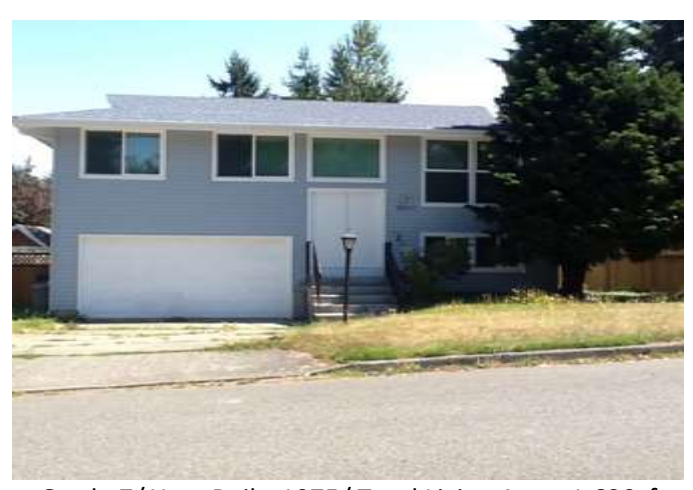
Grade 7/ Year Built: 1975/ Total Living Area: 1,620sf