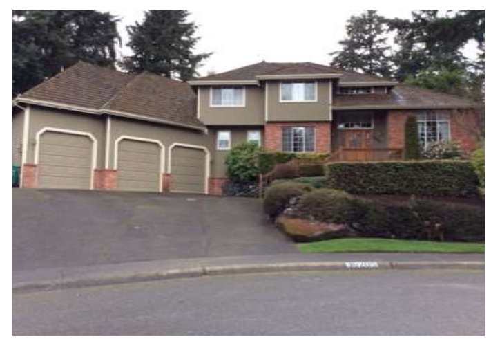
Grade 10/ Year Built: 1989/ Total Living Area: 2,500sf