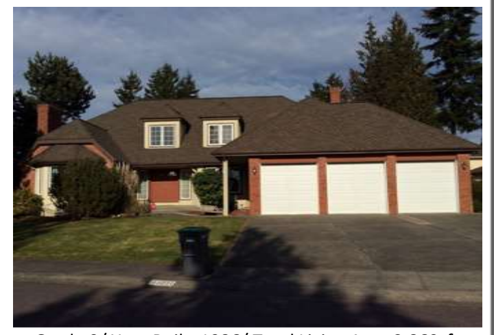
Grade 9/ Year Built: 1986/ Total Living Area 2,860sf