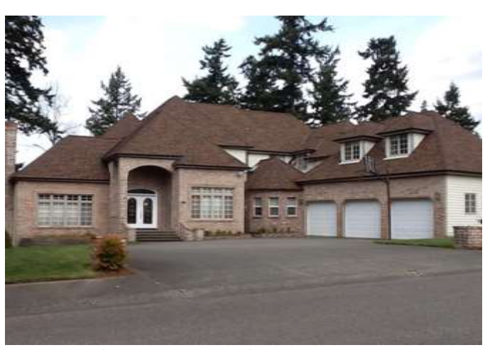
Grade 11/ Year Built: 1991/ Total Living Area: 4,620sf