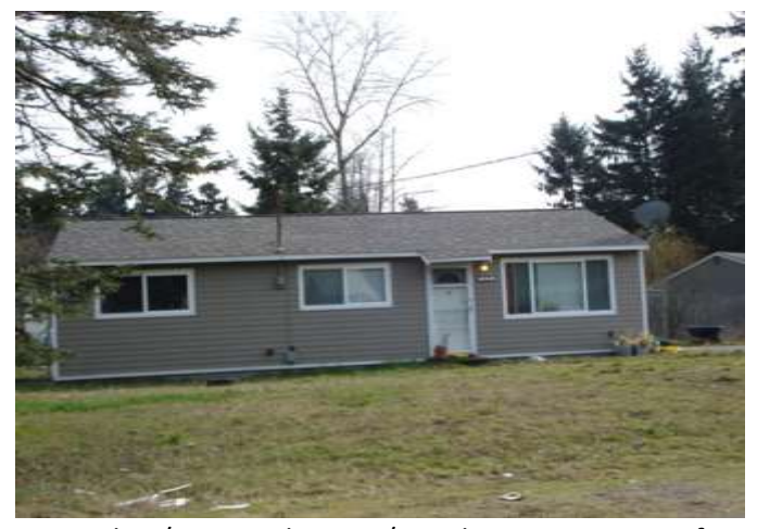
Grade 6/ Year Built: 1958/ Total Living Area: 800sf