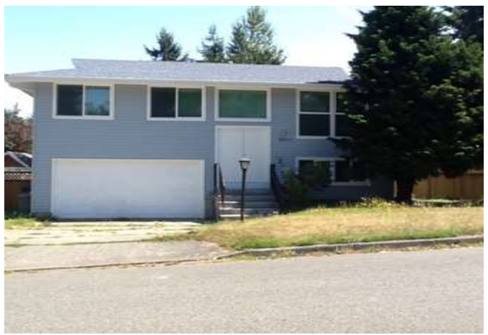
Grade 7/ Year Built: 1975/ Total Living Area: 1,620sf