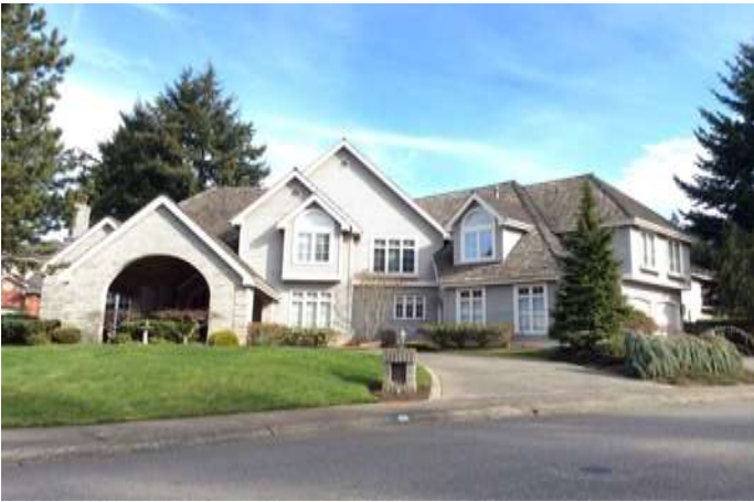
Grade 12/ Year Built: 1988/ Total Living Area: 4,960sf