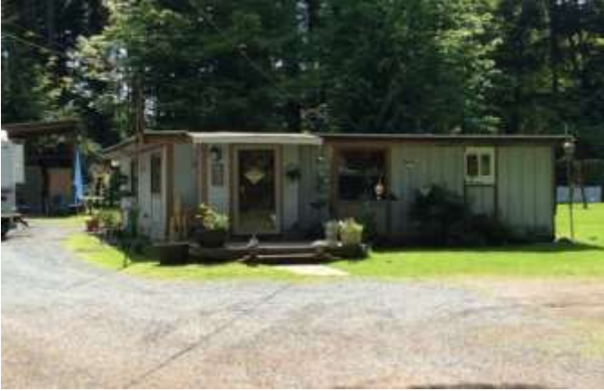
Grade 4/ Year Built: 1964/ Total Living Area: 930sf