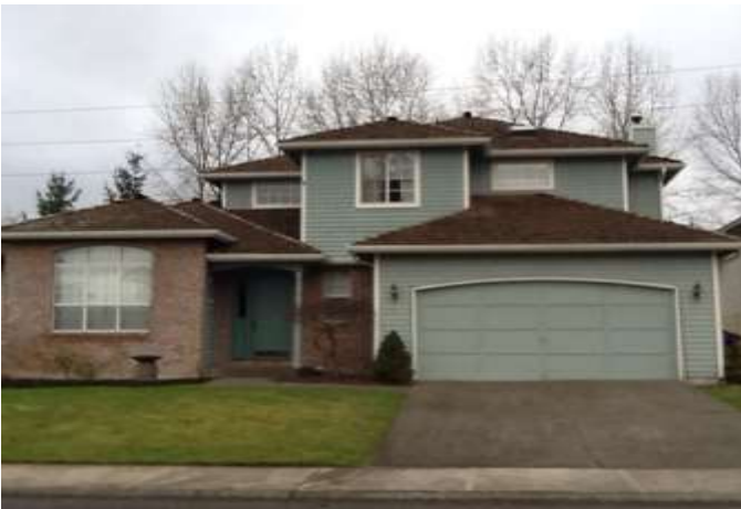
Grade 8/ Year Built: 1991/ Total Living Area: 2,030sf