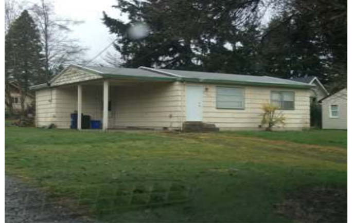
Grade 5/ Year Built: 1955/ Total Living Area: 910sf