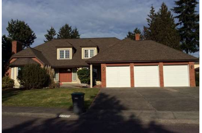
Grade 9/ Year Built: 1986/ Total Living Area 2,860sf