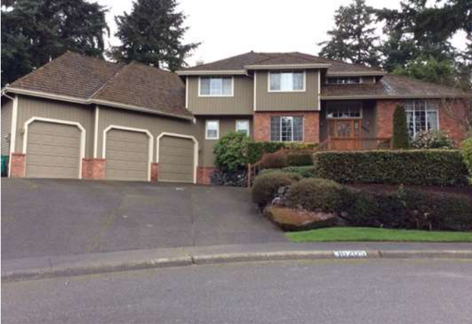
Grade 10/ Year Built: 1989/ Total Living Area: 2,500sf