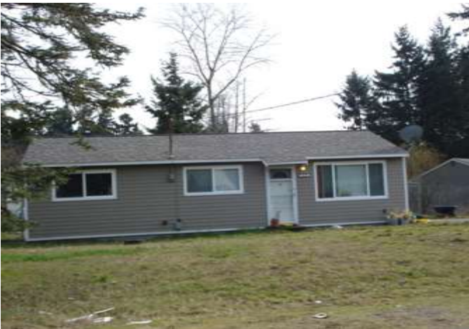
Grade 6/ Year Built: 1958/ Total Living Area: 800sf