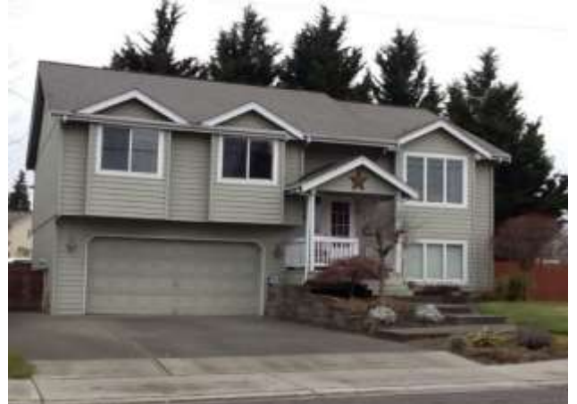
Grade 7/ Year Built 1996/ 1,980sf Total Living Area