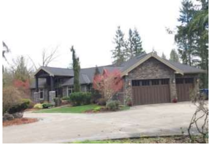
Grade 11 / Year Built 2006 / 4,490sf Total Living Area