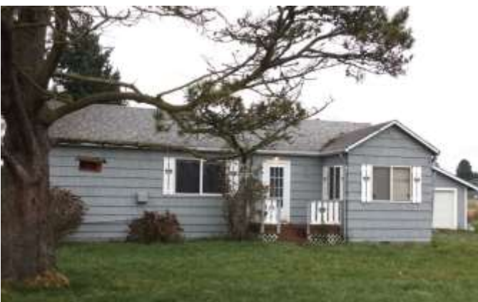
Grade 6 / Year Built 1945 / 1,260sf Total Living Area