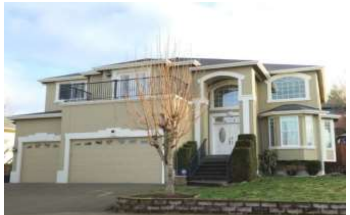
Grade 9/ Year Built 2004/ 3,130sf Total Living Area