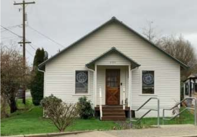
Grade 4/ Year Built 1937/ 960sf Total Living Area