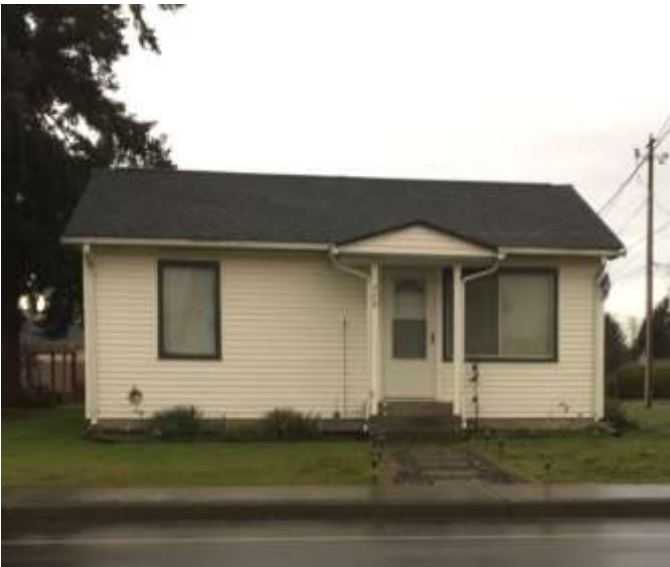
Grade 5/ Year Built 1956 / 630sf Total Living Area