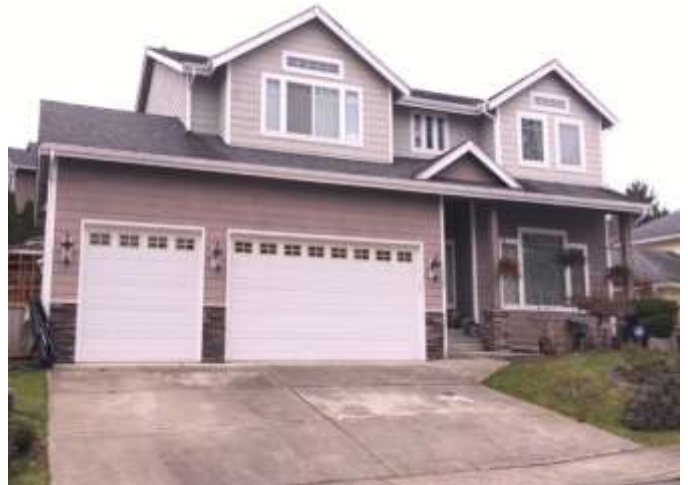
Grade 8/ Year Built 2002/ 2,650sf Total Living Area