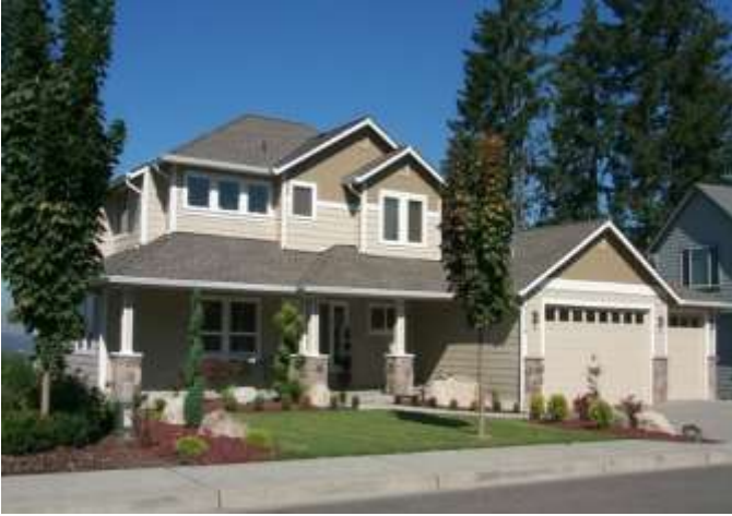
Grade 10/ Year Built 2005/ 3,620sf Total Living Area