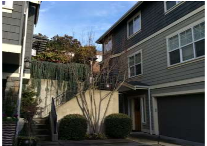
Grade 10 (TH)/Year Built 2005/TLA 2070 SF