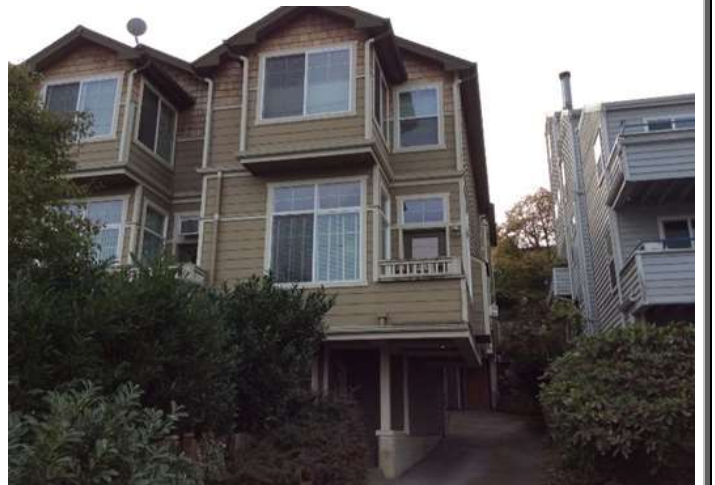
Grade 8 (TH)/Year Built 2004/TLA 1370 SF