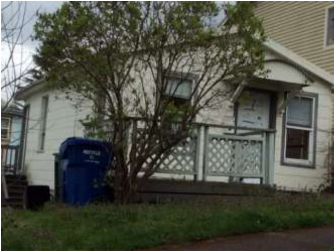
Grade 5/Year Built 1925/TLA 480 SF