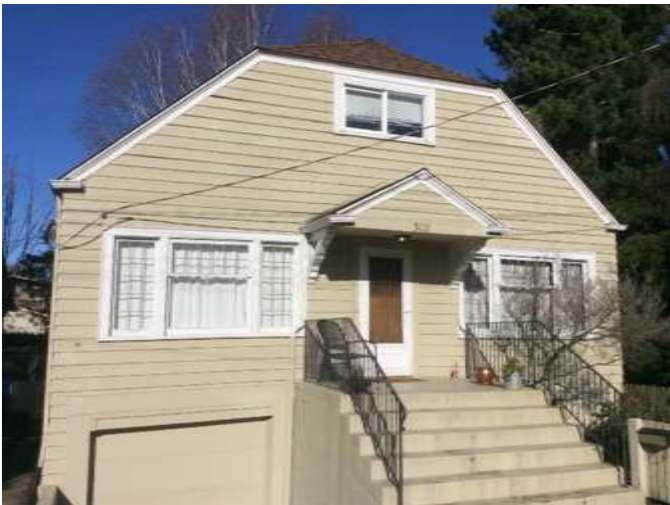
Grade 7/ Year Built 1958/ TLA 1580 SF