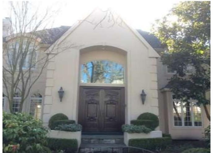
Grade 12/ Year Built 1993/ TLA 6190 SF