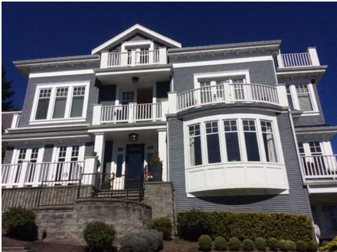
Grade 10/ Year Built 2008/ TLA 2450 SF