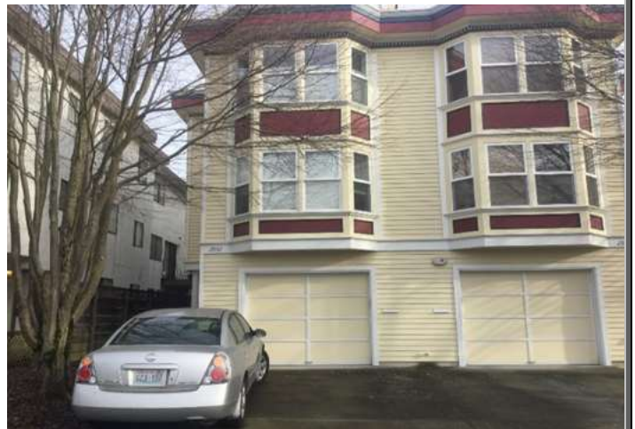
Grade 7 (TH)/Year Built 1992/TLA 1610 SF