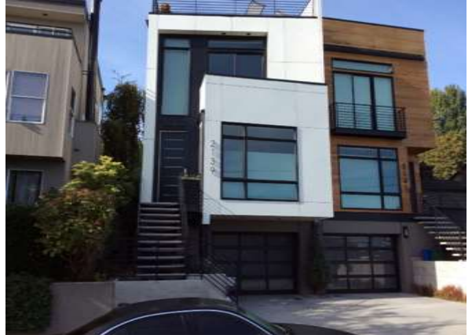
Grade 9 (TH)/ Year Built 2013/ TLA 1960 SF