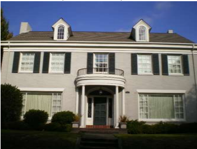
Grade 11/ Year Built 1936/ TLA 4770 SF