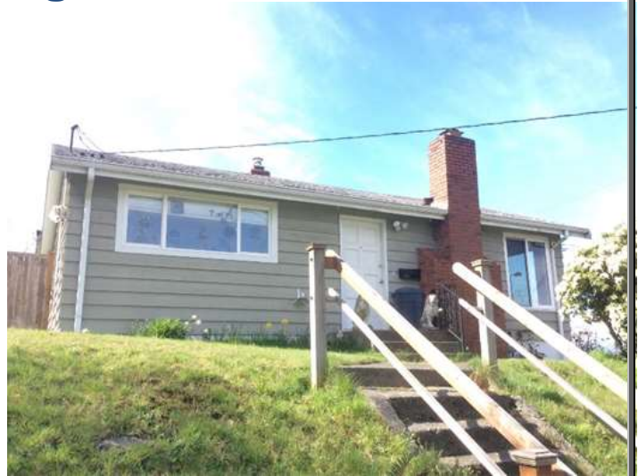
Grade 6/Year Built 1957/TLA 820 SF