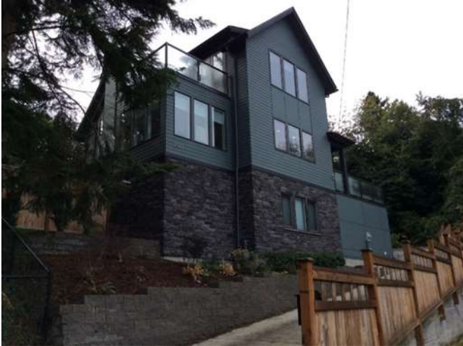
Grade 9/ Year Built 2014/ TLA 3660 SF