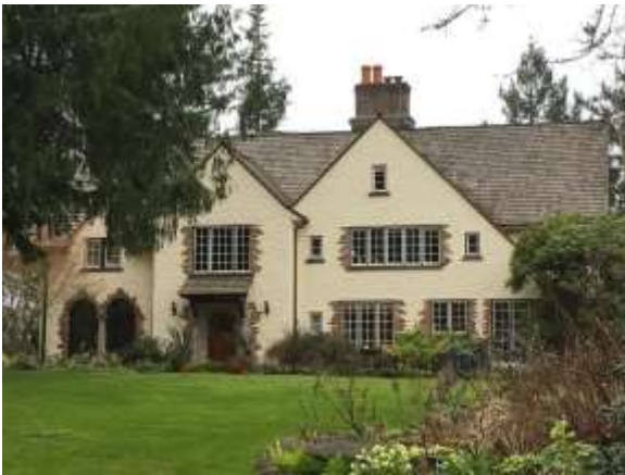
Grade 12/ Year Built 1922/TLA 7480