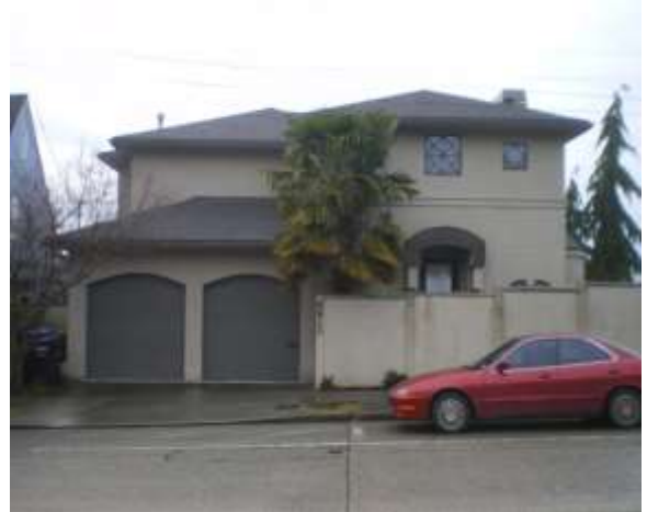
Grade 10/ Year Built 1997/Total Living Area 2720