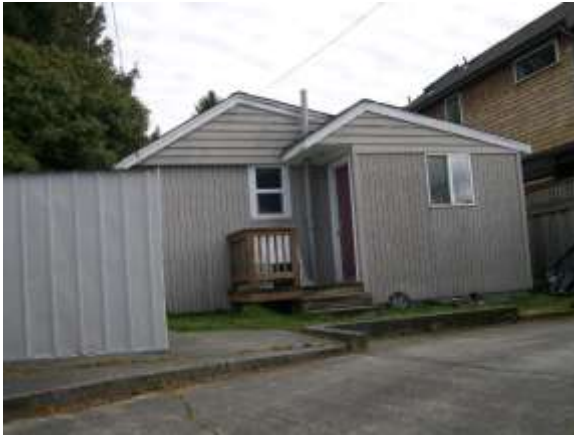
Grade 5/ Year Built 1948/ TLA 620