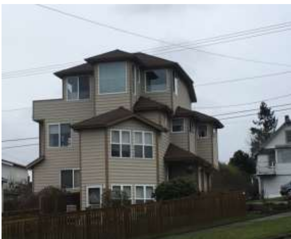
Grade 9/ Year Built 1995/ TLA 1900