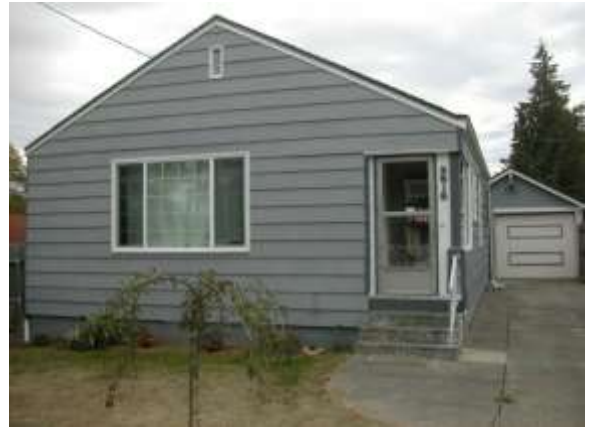
Grade 6/ Year Built 1924/ TLA 740