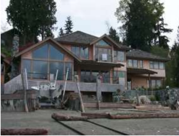
Grade 11/ Year Built 2000/TLA 5988