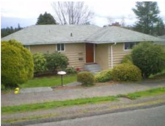
Grade 7/ Year Built 1955/ TLA 1580