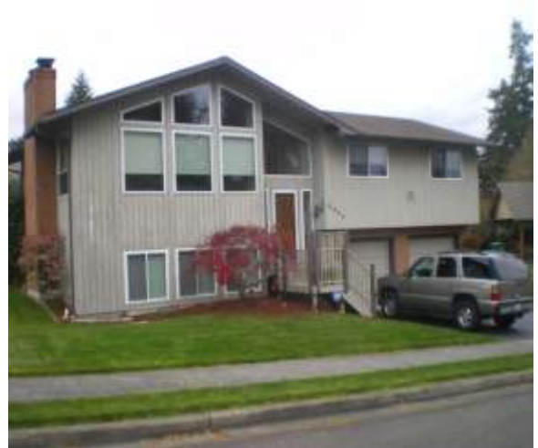
Grade 8/ Year Built 1981/TLA 2120