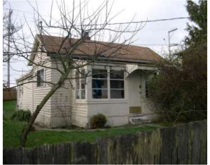
Grade 5/ Year Built 1910/ TLA 610 SF