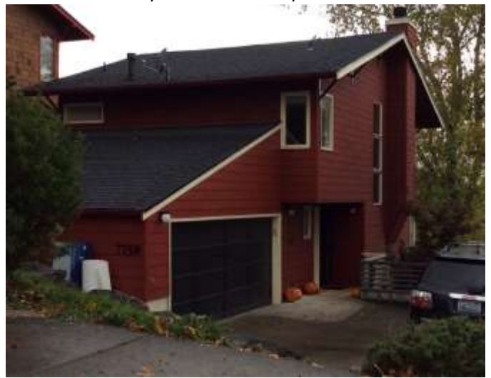
Grade 8 / Year Built 1991/ TLA 2380 SF