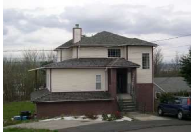
Grade 9/ Year Built 1997/ TLA 2520 SF