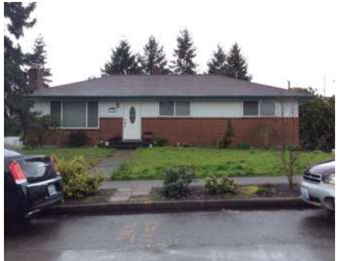
Grade 7/ Year Built 1961/ TLA 1950 SF