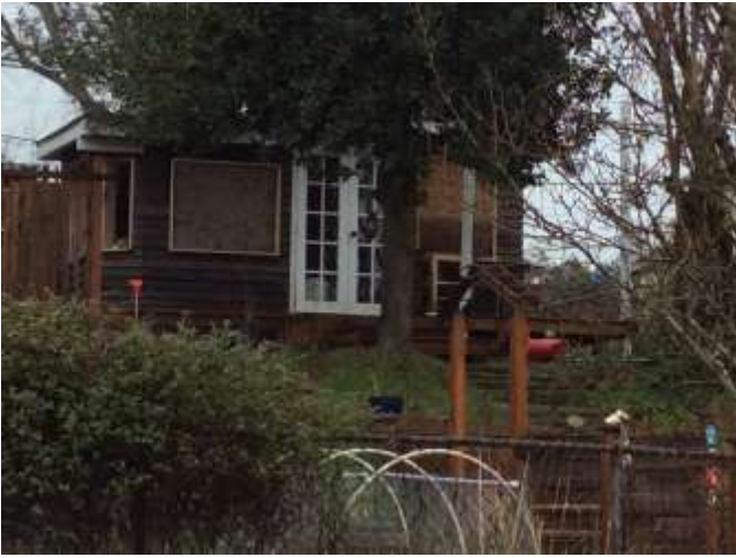
Grade 4/ Year Built 1949/ TLA 420 SF