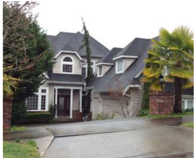
Grade 10/ Year Built 1999/ TLA 3960SF