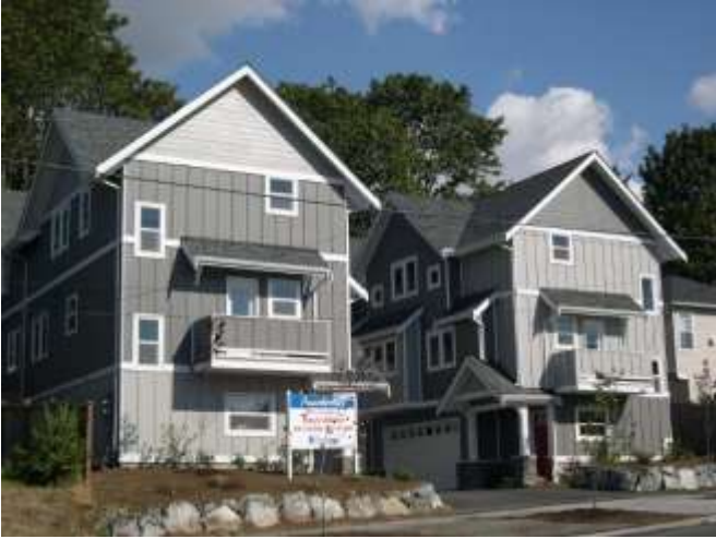
Grade 8 (TH)/ Year Built 2005/ TLA 1470 SF