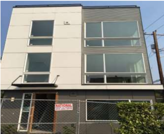
Grade 9 (TH)/ Year Built 2017/ TLA 1700 SF