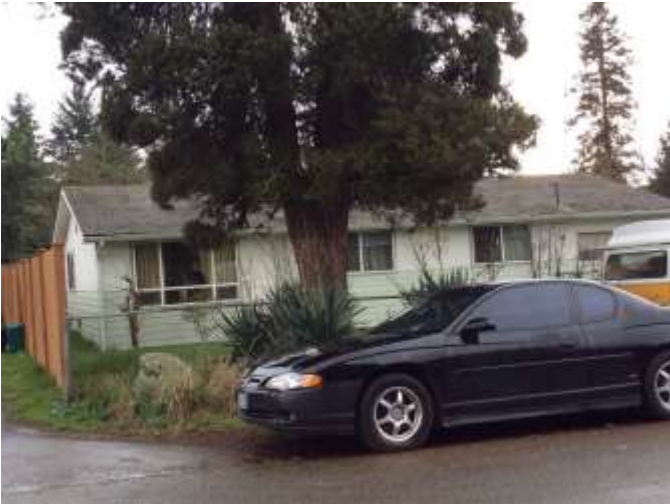
Grade 6/ Year Built 1975/ TLA 960 SF