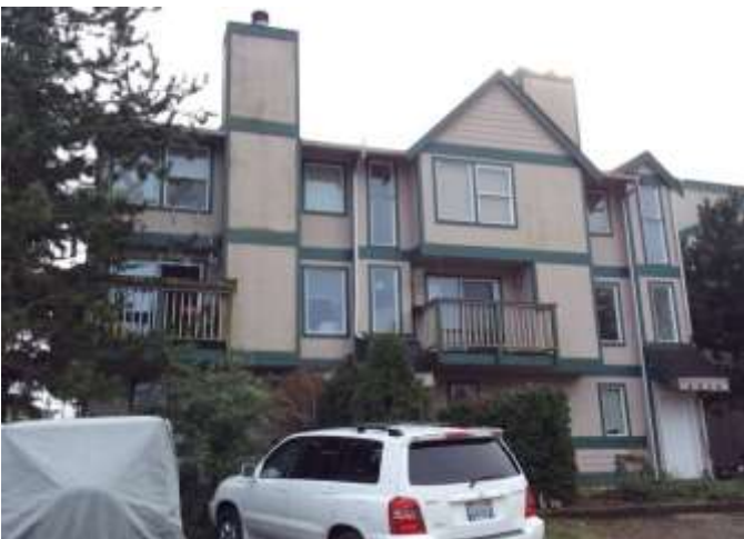
Grade 7 (TH)/ Year Built 1998/ TLA 1170 SF