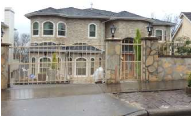
Grade 11/ Year Built 2010/ TLA 4460 SF