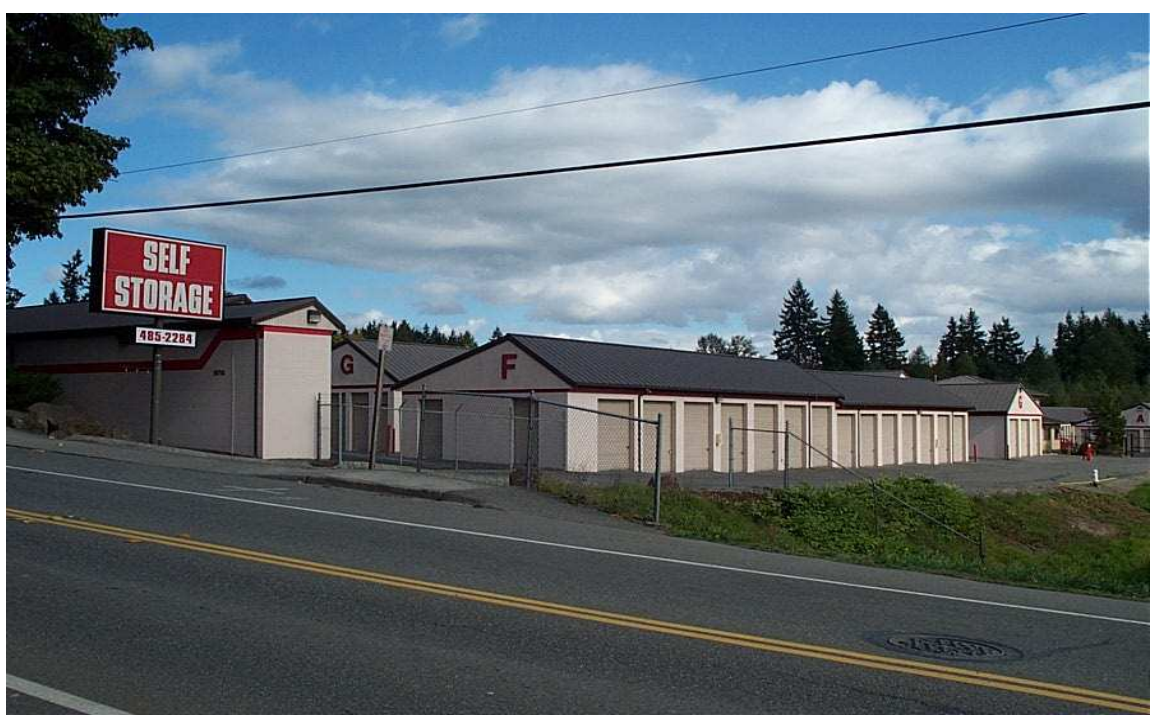
TYPICAL OLDER FACILITY – 18716 68<sup>TH</sup> AVE NE, KENMORE