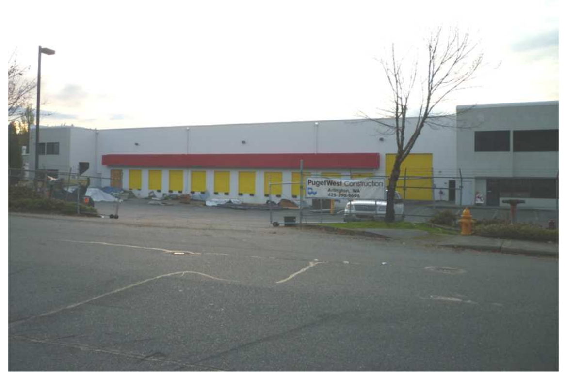
SUBURBAN WAREHOUSE CONVERSION – 7115 132<sup>ND</sup> PL. SE, NEWCASTLE