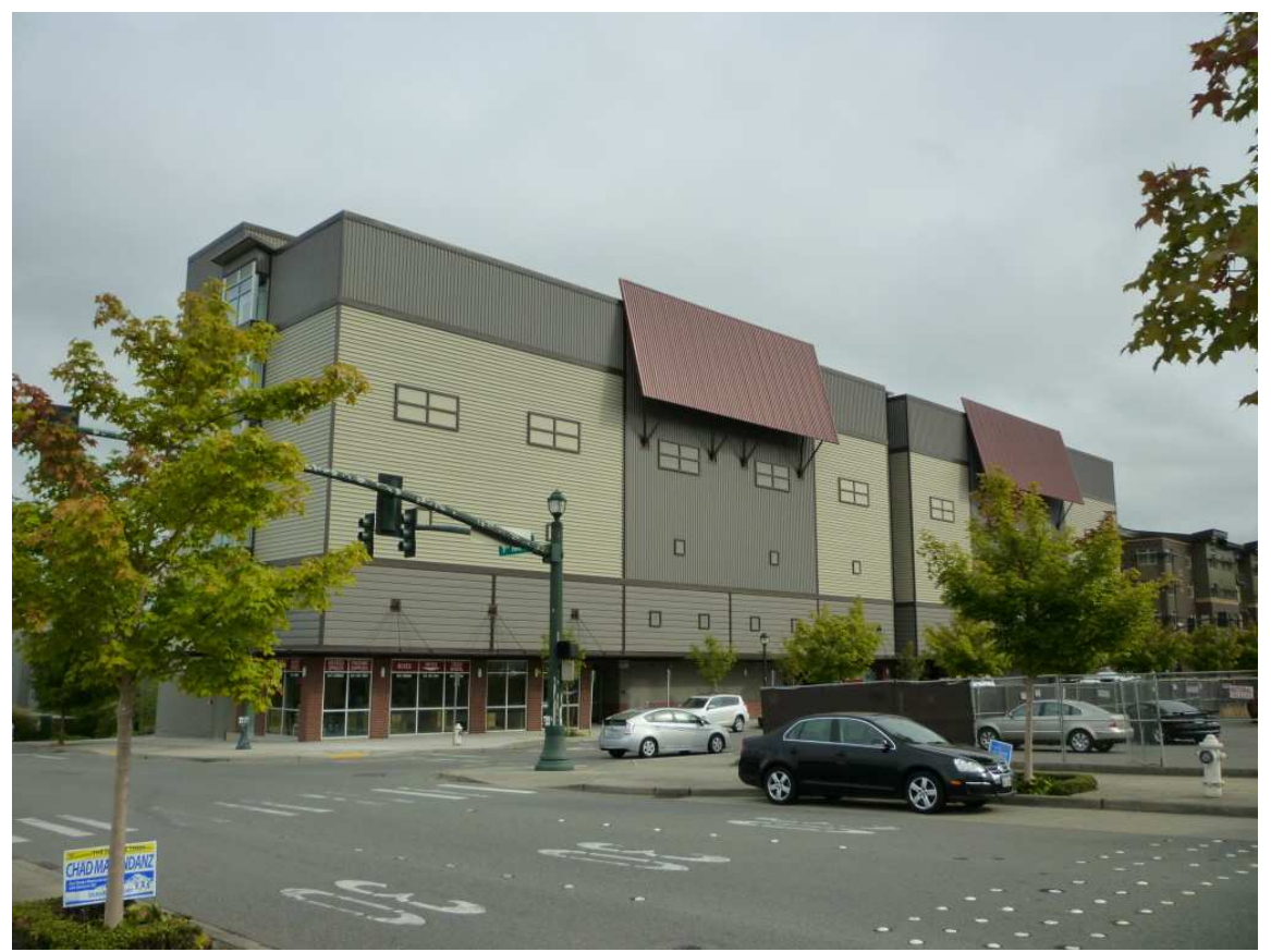
NEW, STATE-OF-THE-ART FACILITY - 910 NE HIGH STREET, ISSAQUAH