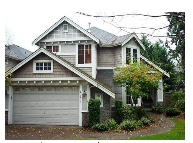
Grade 9/ Year Built 1998/ Total Living Area 2,520