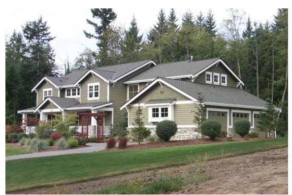
Grade10/ Year Built 2000/ Total Living Area 3,670