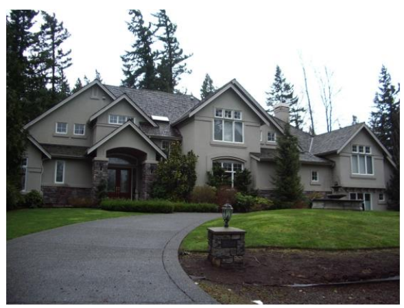
Grade 12/ Year Built 2002/ Total Living Area 5,720