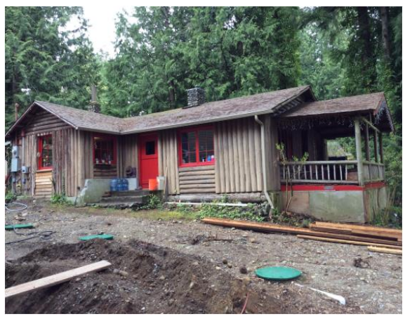
Grade 5/ Year Built 1939/ Total Living Area 1,190