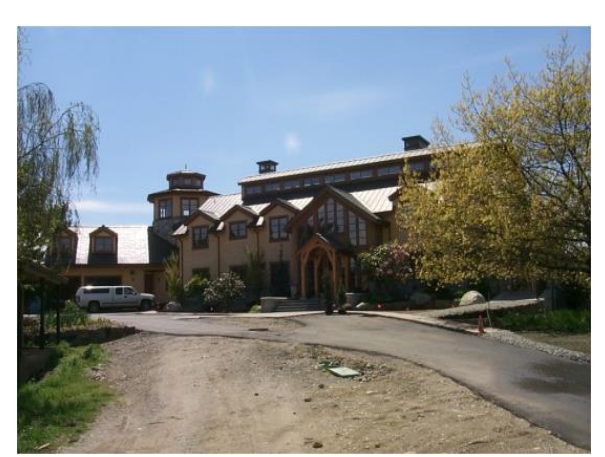
Grade 13/ Year Built 2001/ Total Living Area 10,330