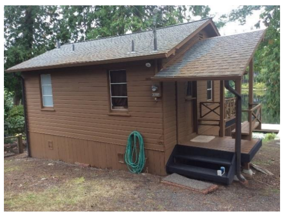
Grade 4/ Year Built 1950/ Total Living Area 320