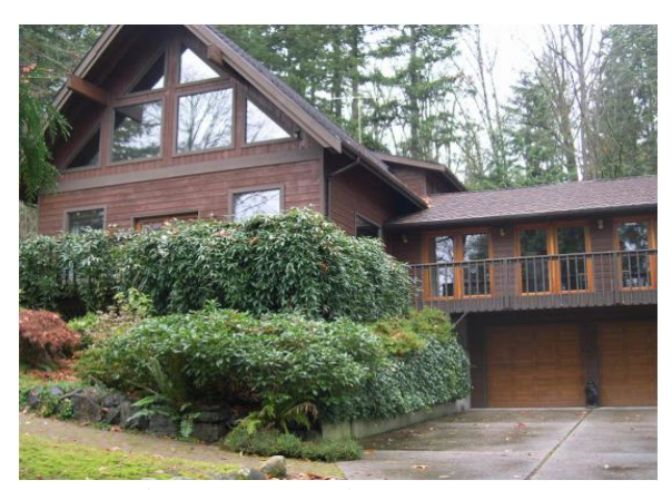
Grade 8/ Year Built 1987/ Total Living Area 2,880