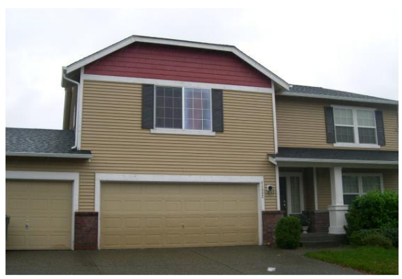
Grade 7/ Year Built 2003/ Total Living Area 3,500