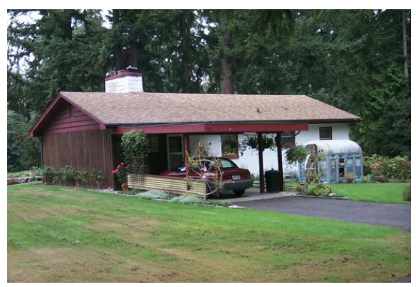
Grade 6/ Year Built 1957/ Total Living Area 1,150