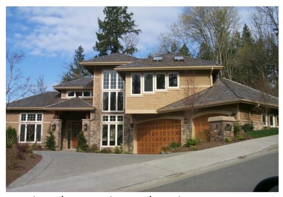
Grade 11/ Year Built 2005/ Total Living Area 5,300