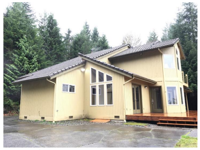
Grade 8/ Year Built 1991/ Total Living Area 2,470sf