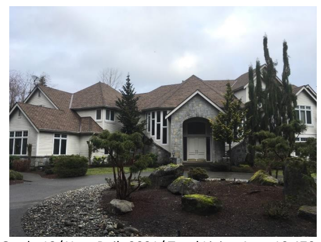
Grade 13/ Year Built 2001/ Total Living Area 10,470sf