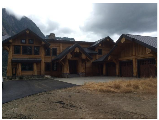
Grade 12/ Year Built 2013/ Total Living Area 5,550sf