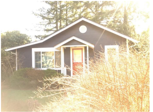
Grade 5/ Year Built 1925/ Total Living Area 750sf