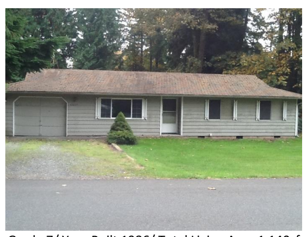
Grade 7/ Year Built 1986/ Total Living Area 1,140sf