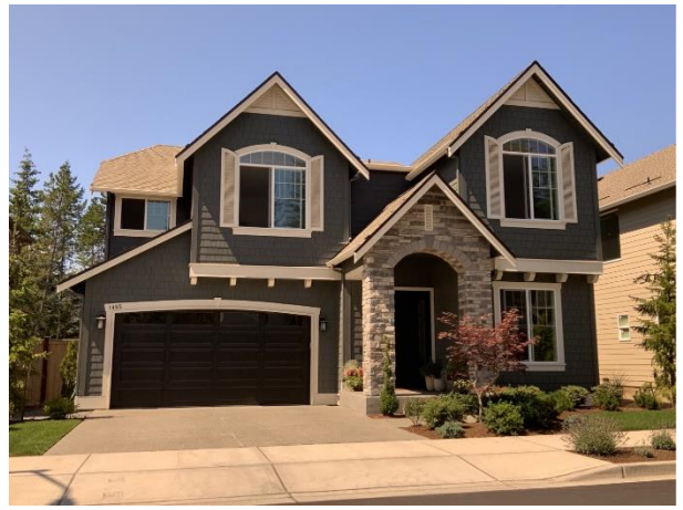
Grade 9/ Year Built 2020/ Total Living Area 3,500sf