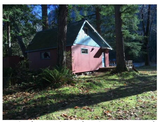
Grade 3/ Year Built 1961/ Total Living Area 440sf