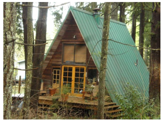
Grade 4/ Year Built 1966/ Total Living Area 530sf