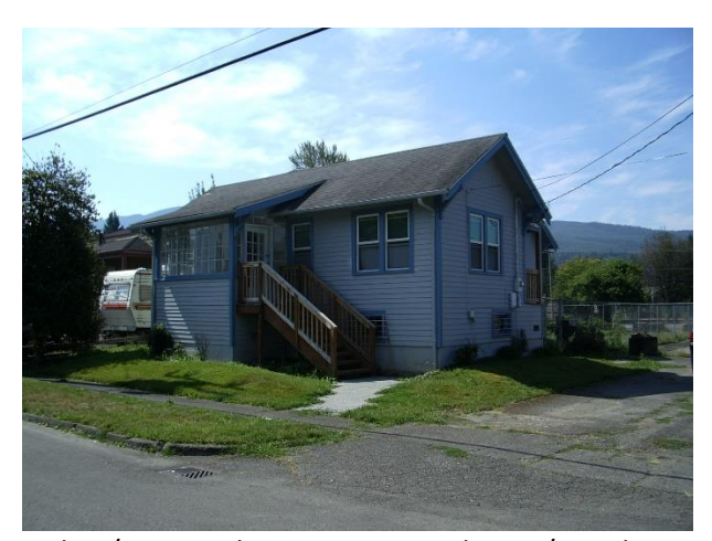
Grade 6/ Year Built 1922 renovated 1990/ Total Living Area 970sf