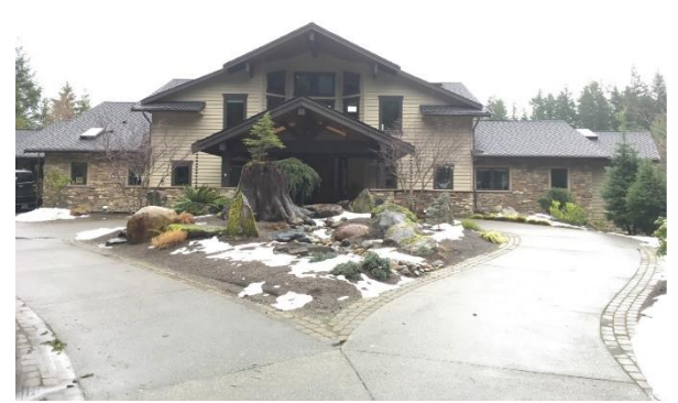
Grade 11/ Year Built 2008/ Total Living Area 6,510sf