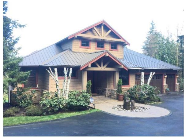
Grade 10/ Year Built 2003/ Total Living Area 3,970sf