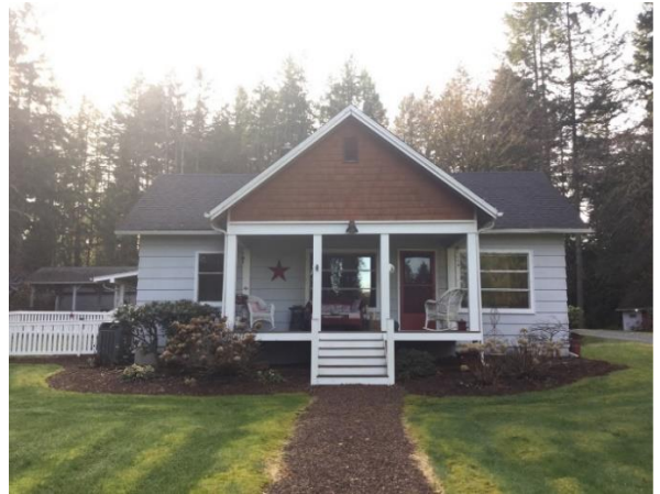
Grade 6/ Year Built 1920/ Total Living Area 1,650sf