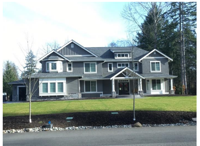
Grade 10/ Year Built 2018/ Total Living Area 3,600sf