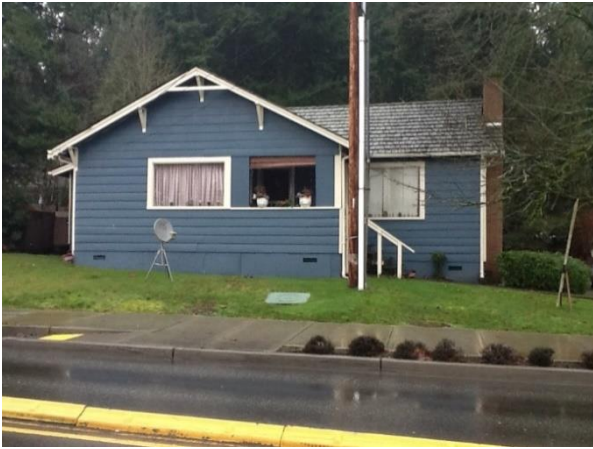
Grade 5/ Year Built 1930/ Total Living Area 1,050sf