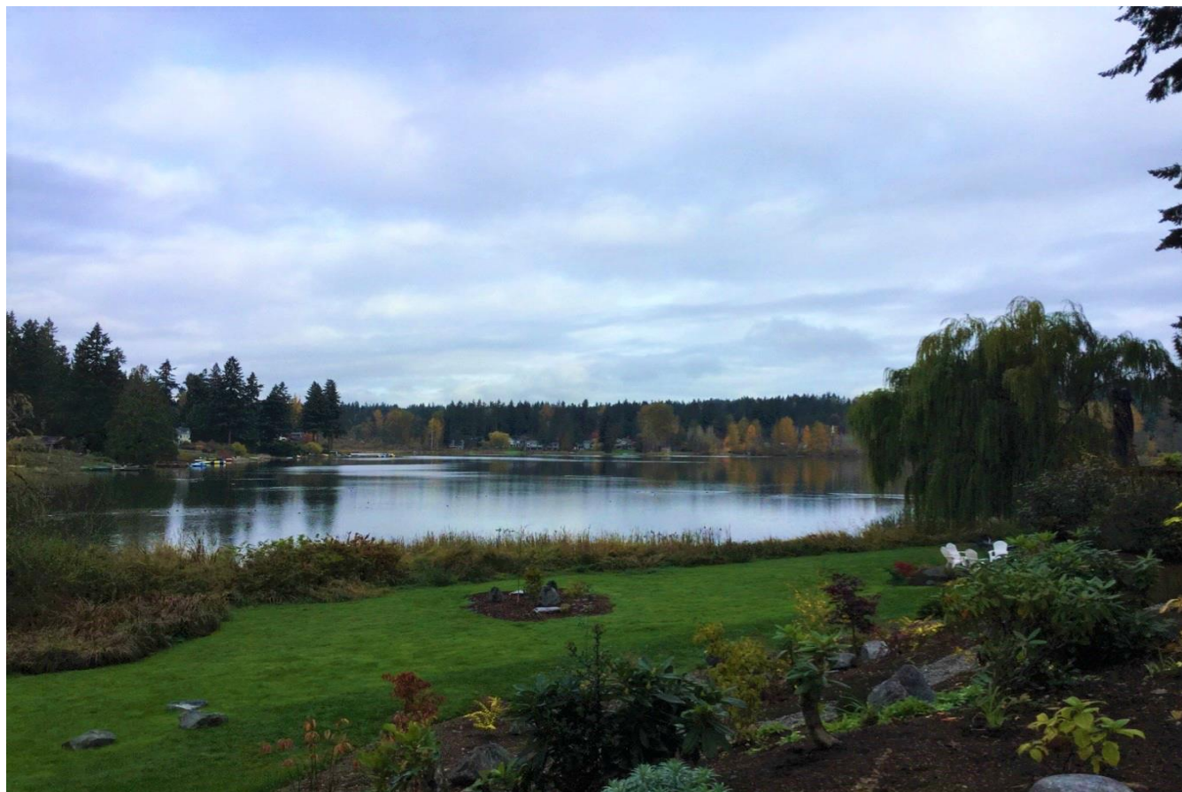
Cottage Lake, King County, Washington.