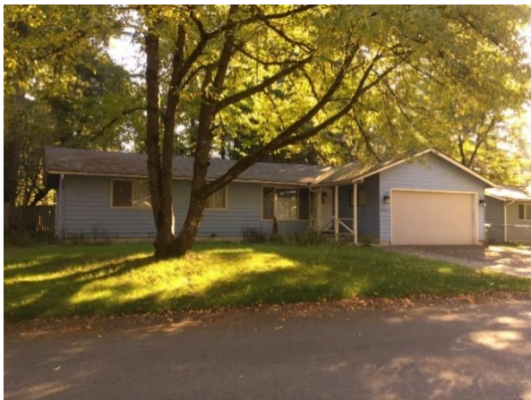
Grade 7/ Year Built 1968/ Total Living Area 1,150sf