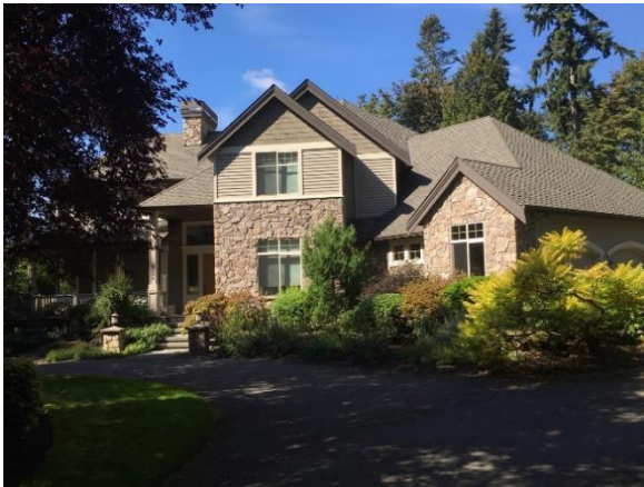
Grade 11/ Year Built 2003/ Total Living Area 4,880sf