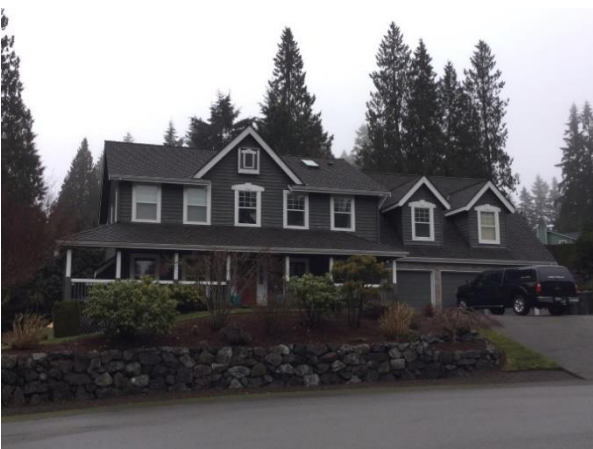
Grade 9/ Year Built 1998/ Total Living Area 3,230sf