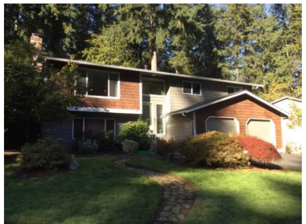
Grade 8/ Year Built 1989/ Total Living Area 2,740sf