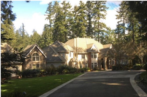
Grade 13 /Year Built 1998/ Total Living Area 9,240sf