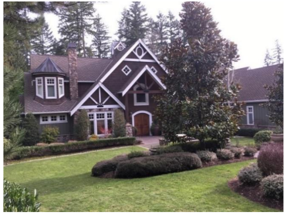
Grade 12/ Year Built 2005/ Total Living Area 5,850sf