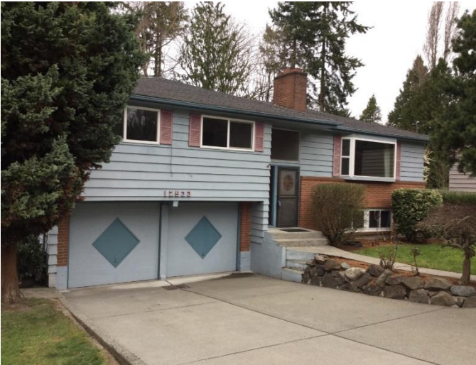
Grade 7/ Year Built 1958/ Total Living Area 1,840 sf