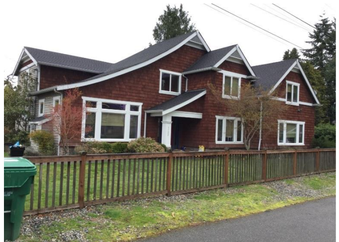
Grade 10/ Year Built 2001/ Total Living Area 3,770 sf