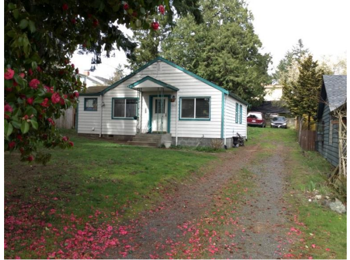
Grade 6/ Year Built 1947/ Total Living Area 620 sf