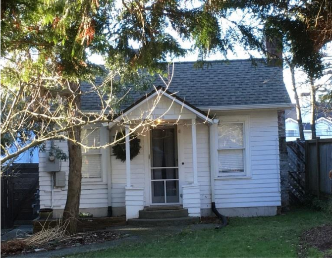
Grade 5/ Year Built 1924/ Total Living Area 730 sf