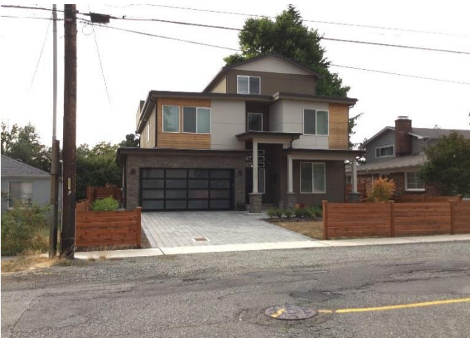
Grade 9/ Year Built 2016/ Total Living Area 2,920 sf