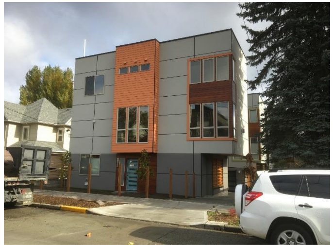
Grade 8/ Year Built 2016/ Total Living Area 1,920 sf