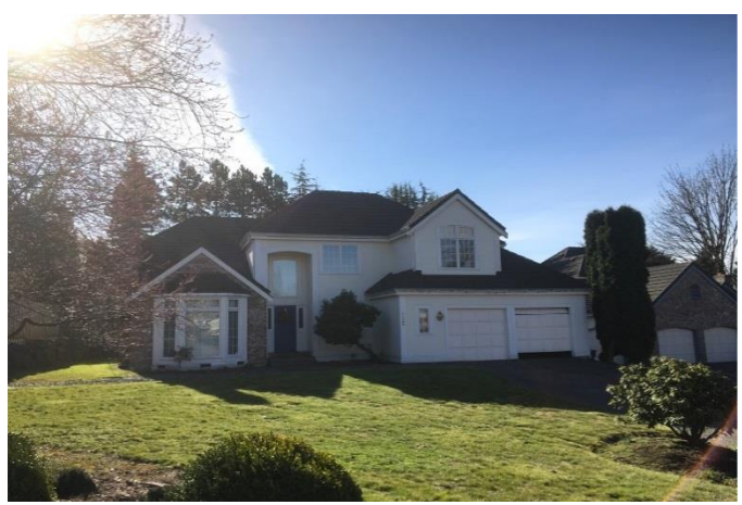
Grade 9/ Year Built 1987/ Total Living Area 2790