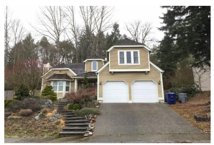
Grade 8/ Year Built 1985/ Total Living Area 2200