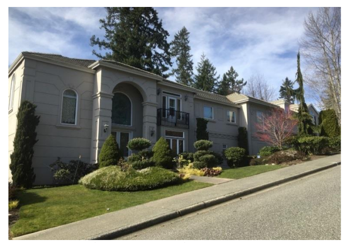
Grade 12/ Year Built 2001/ Total Living Area 6130