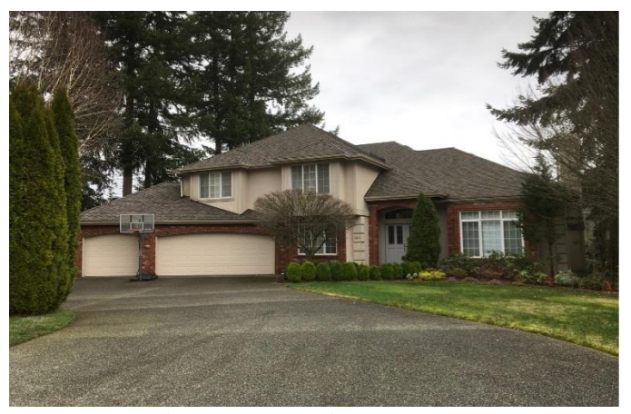
Grade 10/ Year Built 1996/ Total Living Area 4280