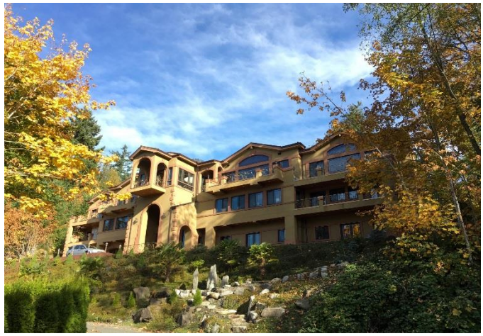
Grade 13/ Year Built 2005/ Total Living Area 7950