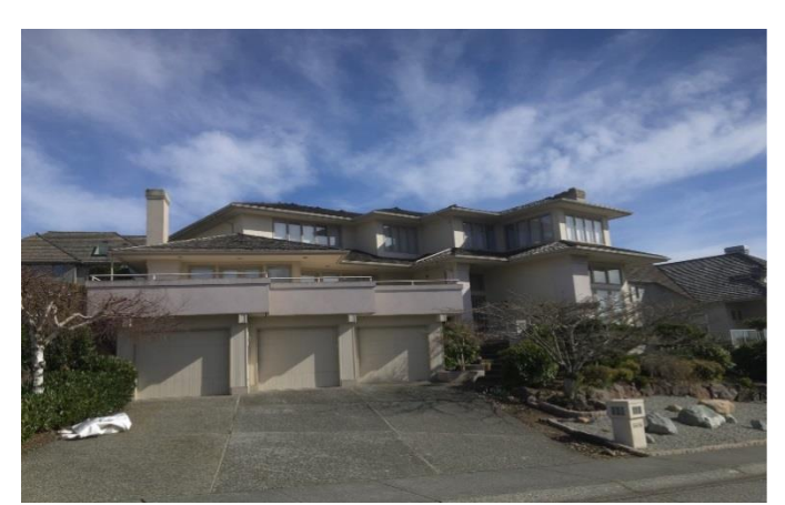
Grade 11/ Year Built 1990/ Total Living Area 3890