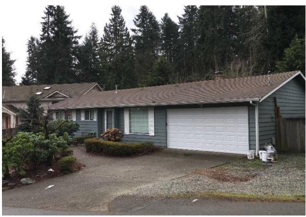
Grade 7/ Year Built 1967/ Total Living Area 1540