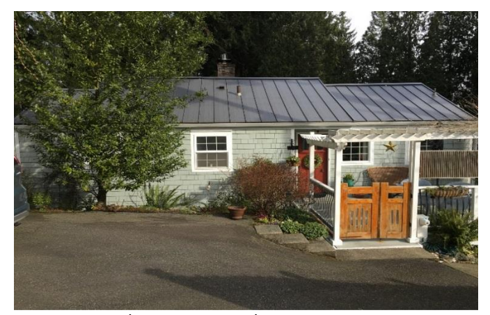
Grade 6/Year Built 1949 / Total Living Area 1780