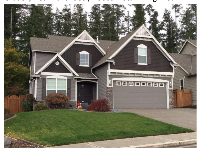
Grade9 / Year Built 2007 / 2790sf Total Living Area