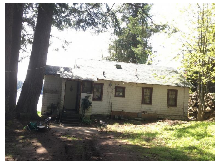
Grade 4/ Year Built 1946/ 740sf Total Living Area