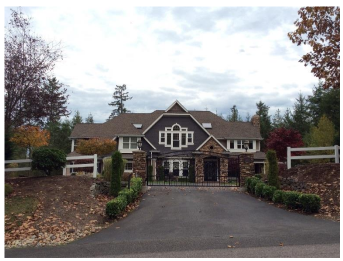
Grade 11/ Year Built 2005 / 5270sf Total Living Area