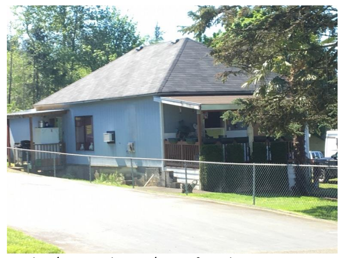
Grade 5/ Year Built 1906/ 1060sf Total Living Area