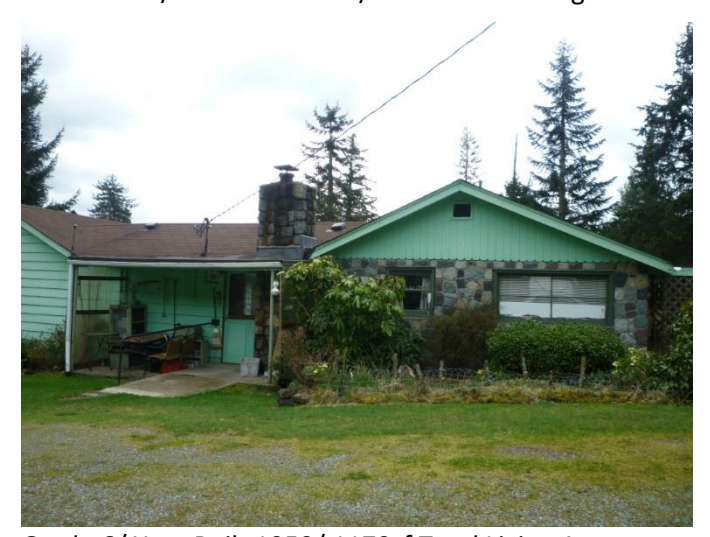
Grade 6/ Year Built 1950/ 1170sf Total Living Area