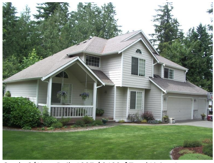
Grade 8/ Year Built 1997 / 2400sf Total Living Area