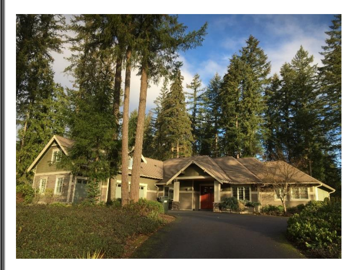
Grade 10/ Year Built 2005 / 3490sf Total Living Area