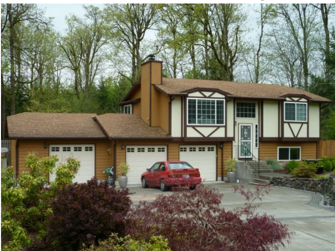
Grade7/ Year Built 1985 / 1500sf Total Living Area