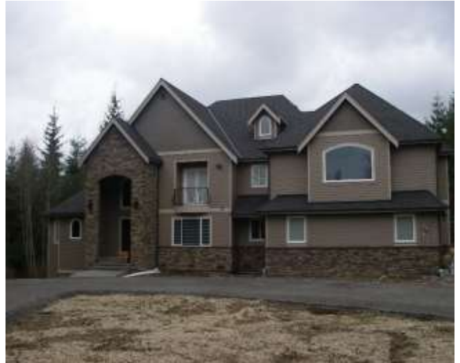
Grade 10/ 2010 Year Built/ 5980sf Total Living Area