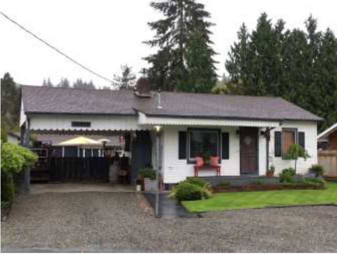
Grade 5/ 1942 Year Built/ 640sf Total Living Area