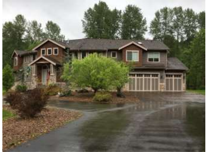
Grade12 / 2006 Year Built/ 6140sf Total Living Area