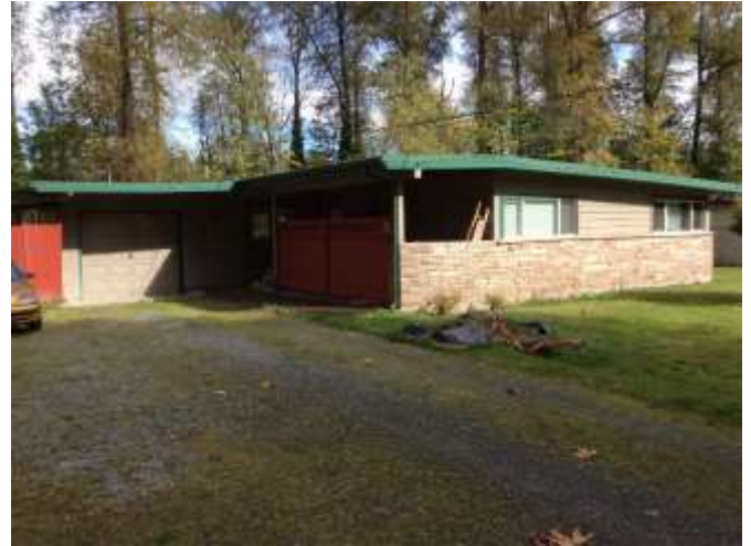
Grade 6/ 1959 Year Built/ 1310sf Total Living Area