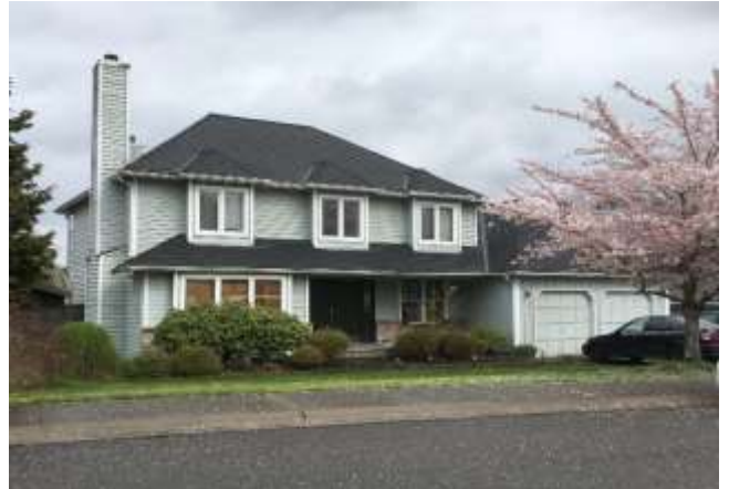
Grade 8/ 1987 Year Built/ 2770sf Total Living Area