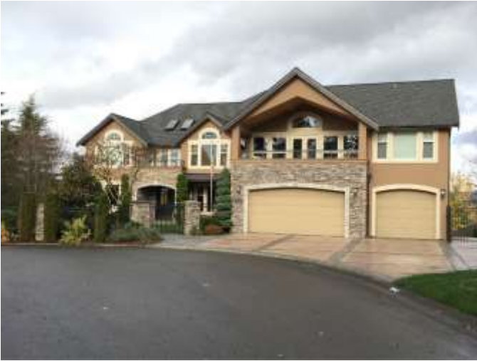
Grade11 / 2006 Year Built/ 5920sf Total Living Area