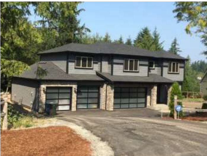
Grade 9/ 2017 Year Built/ 3400sf Total Living Area