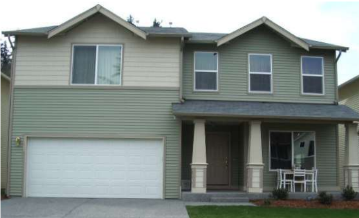
Grade 7/ 2005 Year Built/ 2640sf Total Living Area