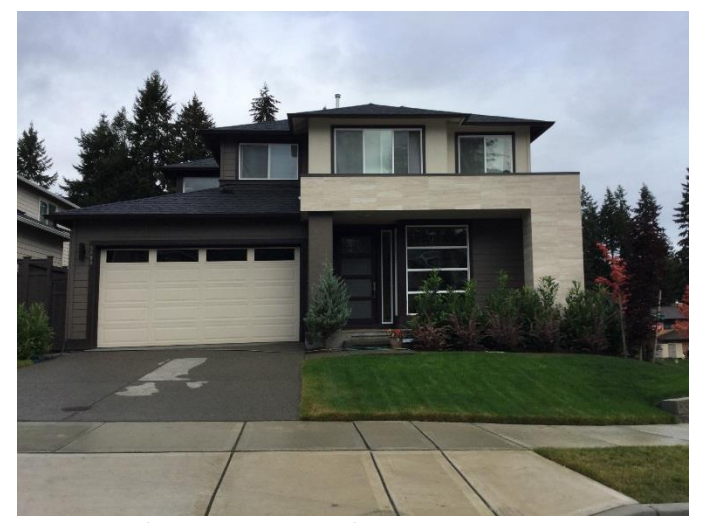
Grade 9/ Year Built: 2015/ Total Living Area: 3,306sf