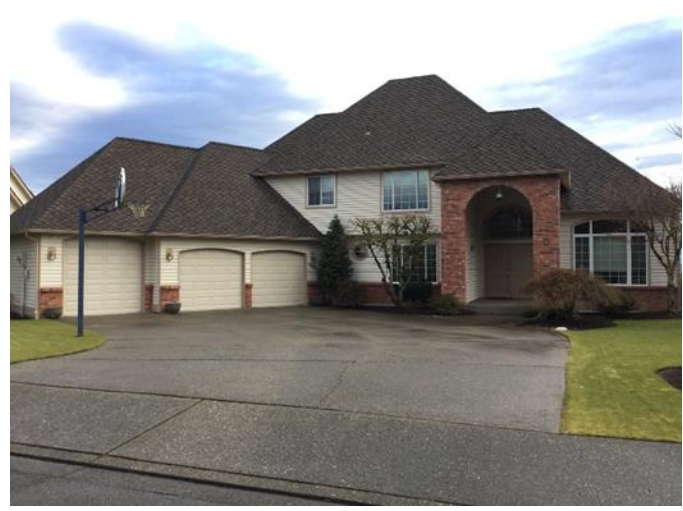
Grade 10/ Year Built: 1991/ Total Living Area: 3,170sf