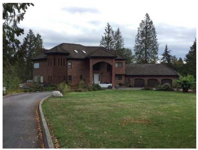
Grade 11/ Year Built: 1989/ Total Living Area: 4,900sf