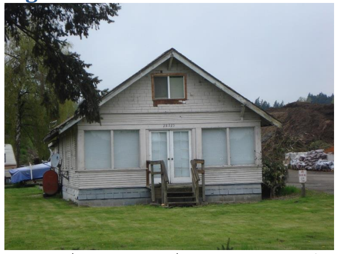
Grade 5/ Year Built: 1918/ Total Living Area: 750sf