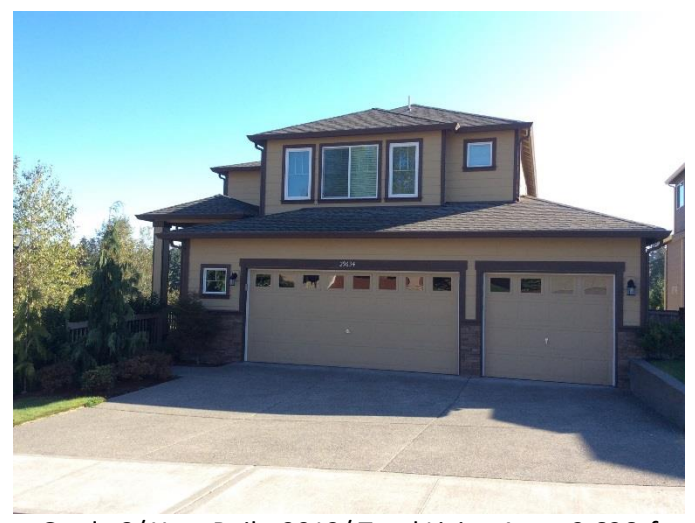
Grade 8/ Year Built: 2013/ Total Living Area: 2,626sf