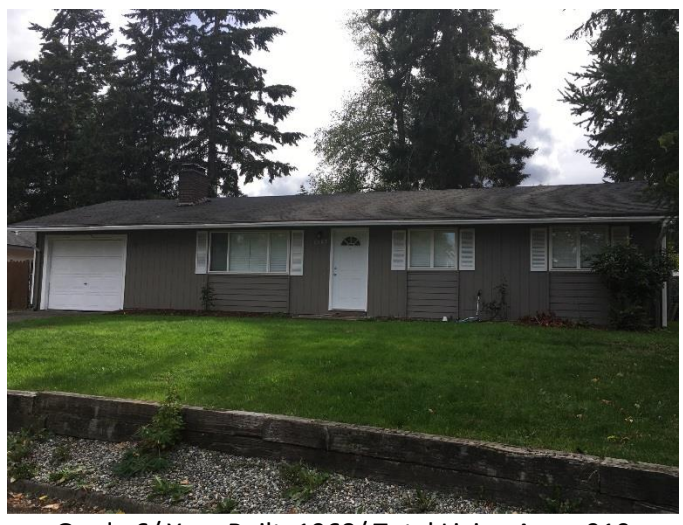
Grade 6/ Year Built: 1968/ Total Living Area: 910