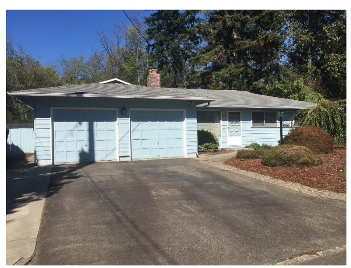
Grade 7/ Year Built: 1967/ Total Living Area: 1,250sf