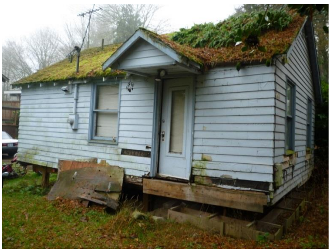
Grade 4/ Year Built: 1942/ Total Living Area: 430sf