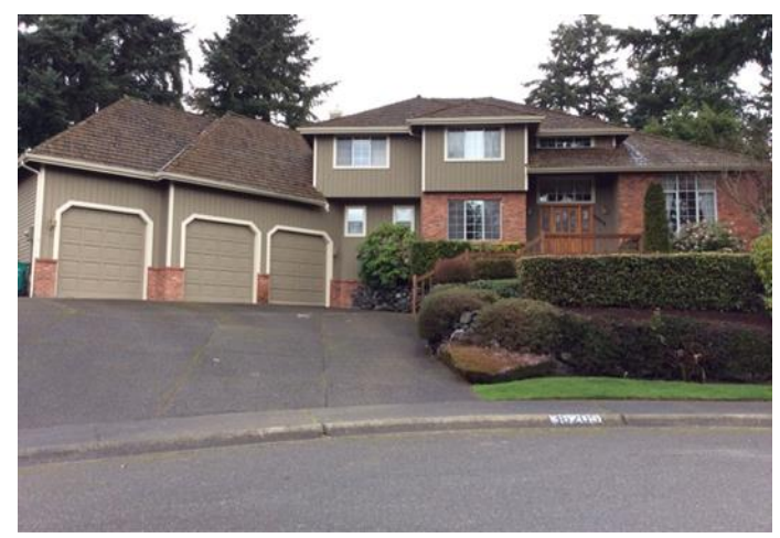
Grade 10/ Year Built: 1989/ Total Living Area: 2,500sf