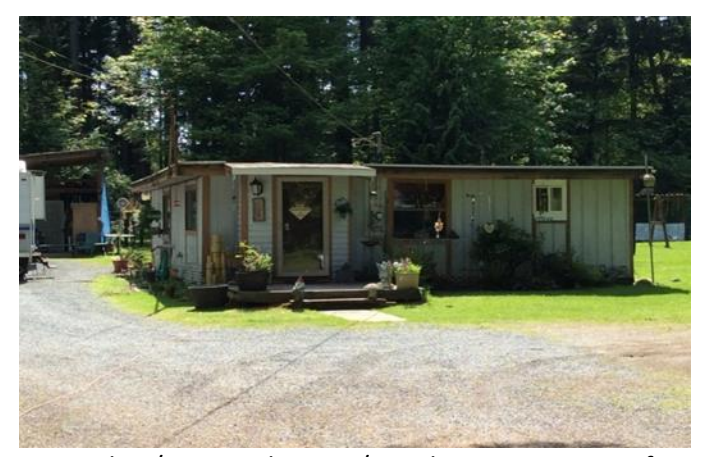
Grade 4/ Year Built: 1964/ Total Living Area: 930sf