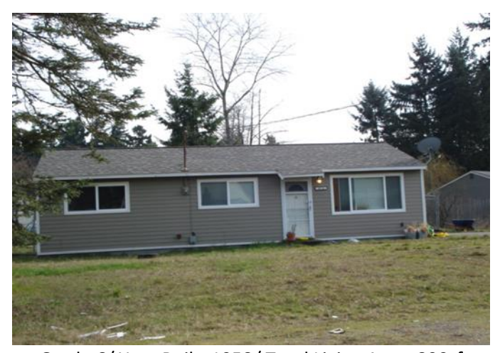
Grade 6/ Year Built: 1958/ Total Living Area: 800sf