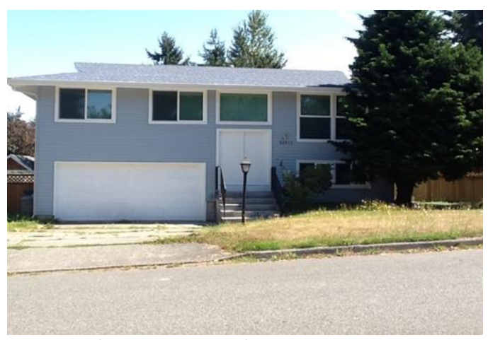
Grade 7/ Year Built: 1975/ Total Living Area: 1,620sf