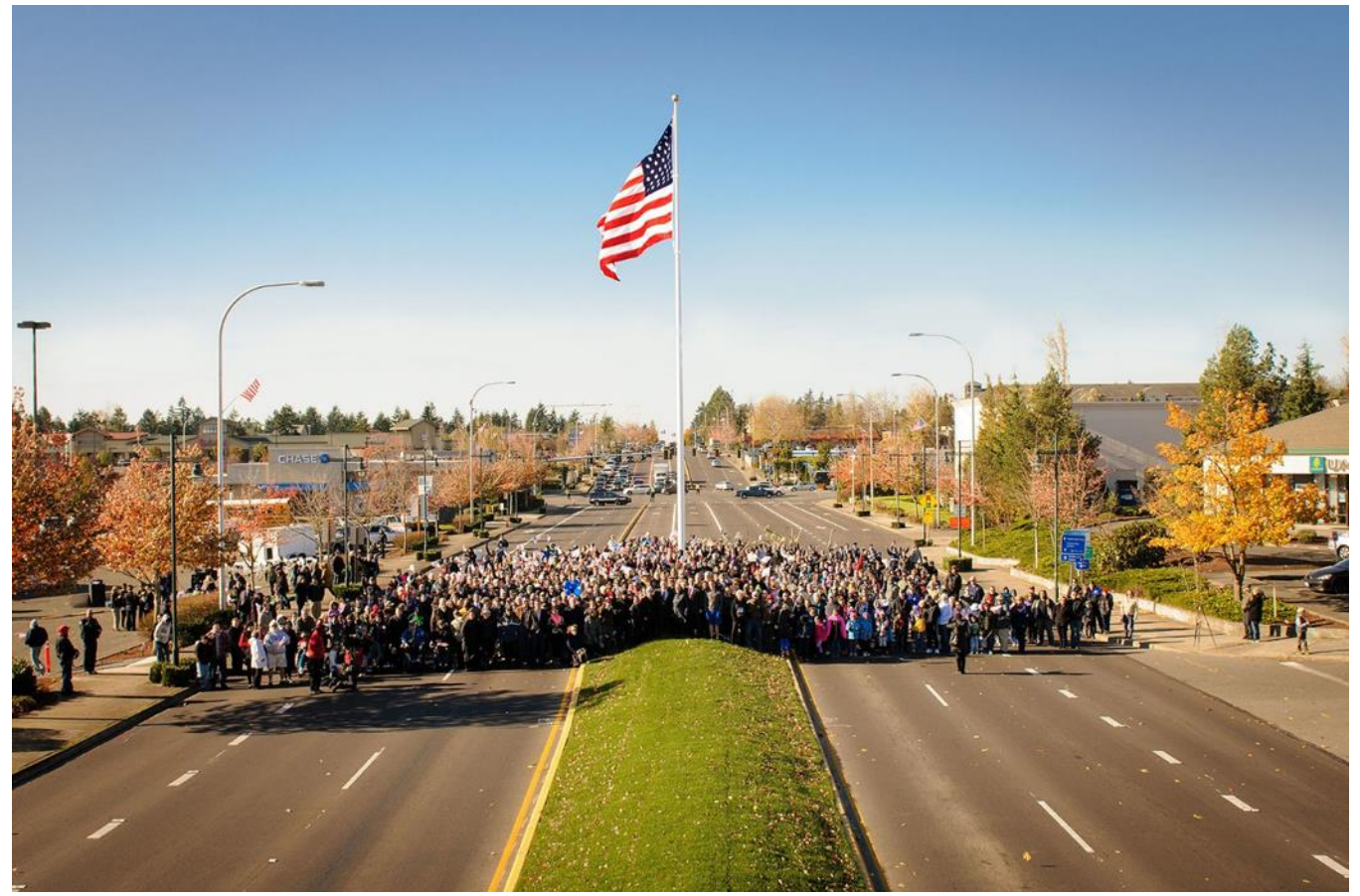
https://en.wikipedia.org/wiki/Federal Way, Washington