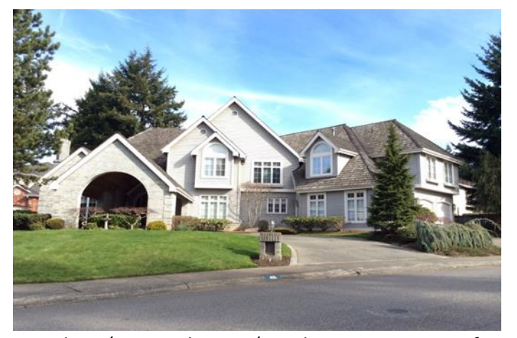
Grade 12/ Year Built: 1988/ Total Living Area: 4,960sf