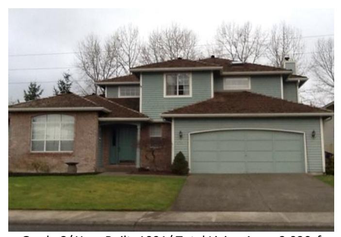
Grade 8/ Year Built: 1991/ Total Living Area: 2,030sf