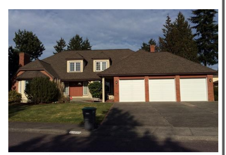
Grade 9/ Year Built: 1986/ Total Living Area 2,860sf