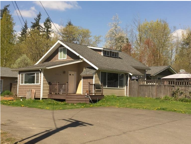
Grade 6/ Year Built 1939/ Total Living Area 2,570 sqft