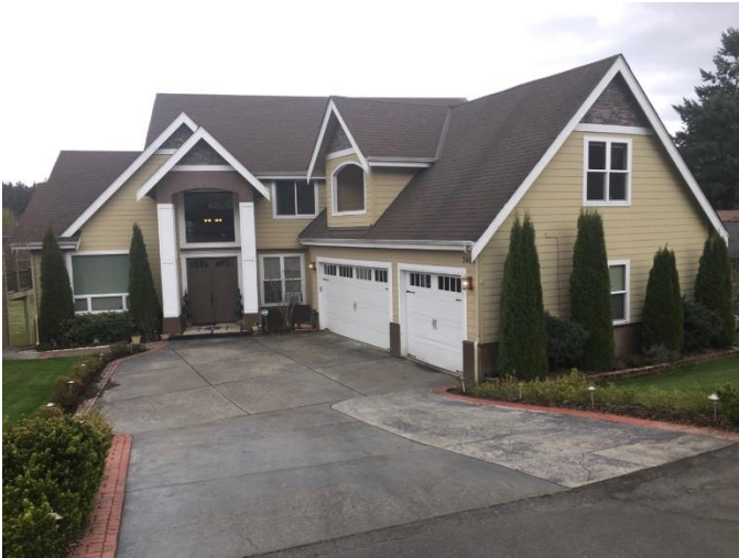
Grade 10/ Year Built 2007/ Total Living Area 3,560 sqft