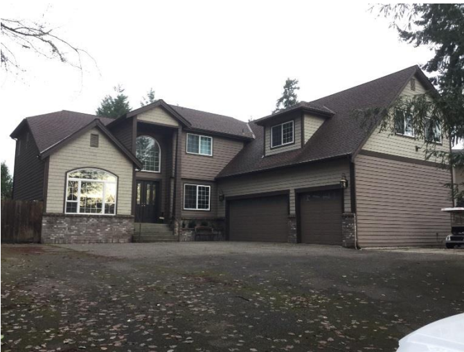
Grade 8/ Year Built 1994/ Total Living Area 3,740 sqft