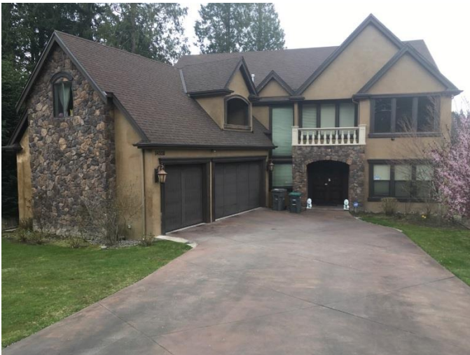
Grade 12/ Year Built 2007/ Total Living Area 7,783 sqft