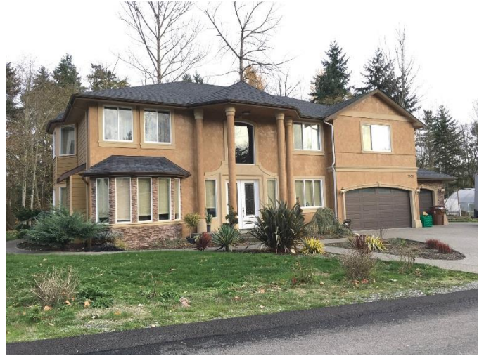
Grade 11/ Year Built 2007/ Total Living Area 4,230 sqft