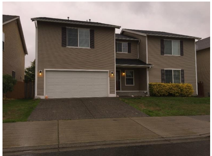
Grade 7/ Year Built 2004/ Total Living Area 3,320 sqft