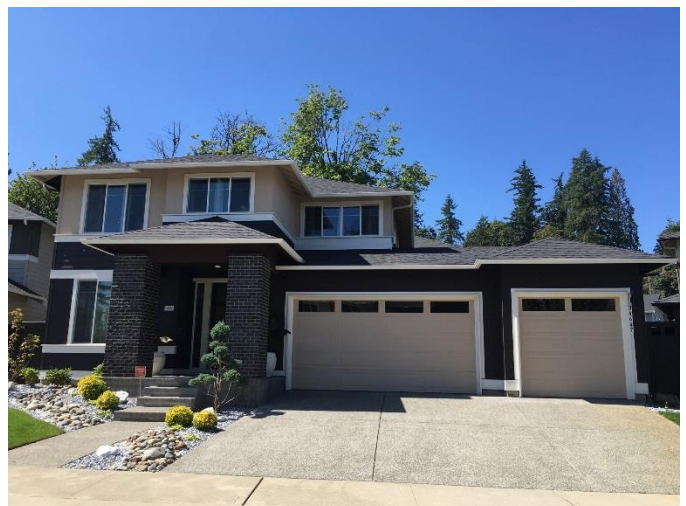
Grade 9/ Year Built 2014/ Total Living Area 3,221 sqft