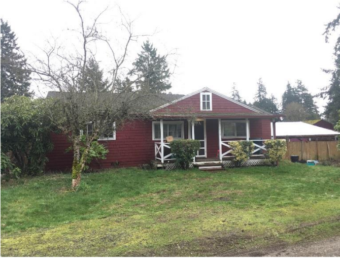
Grade 4/ Year Built 1948/ Total Living Area 830 sqft