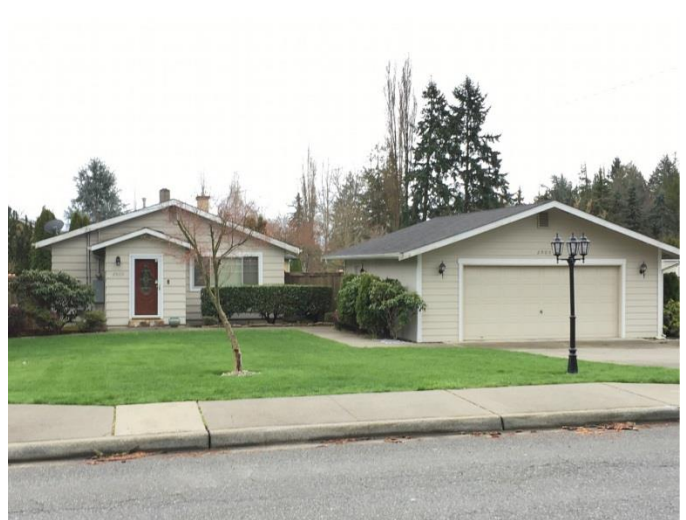
Grade 5/ Year Built 1963/ Total Living Area 1,110 sqft